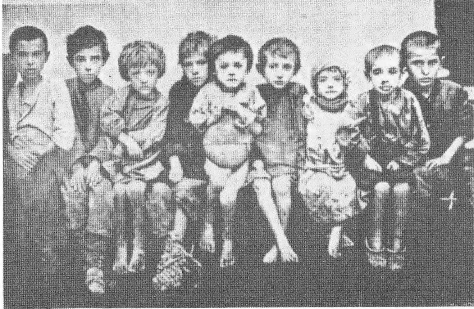
The 'homeless ones'