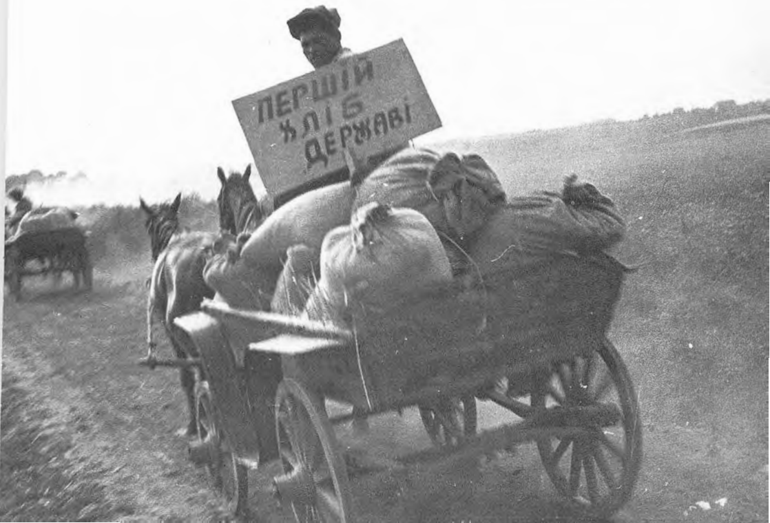
Grain requisitioned in the Odessa area