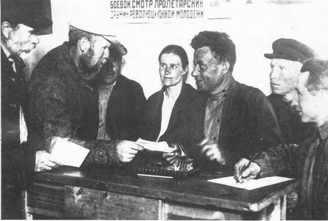
Peasants handing in their applications to join a collective farm