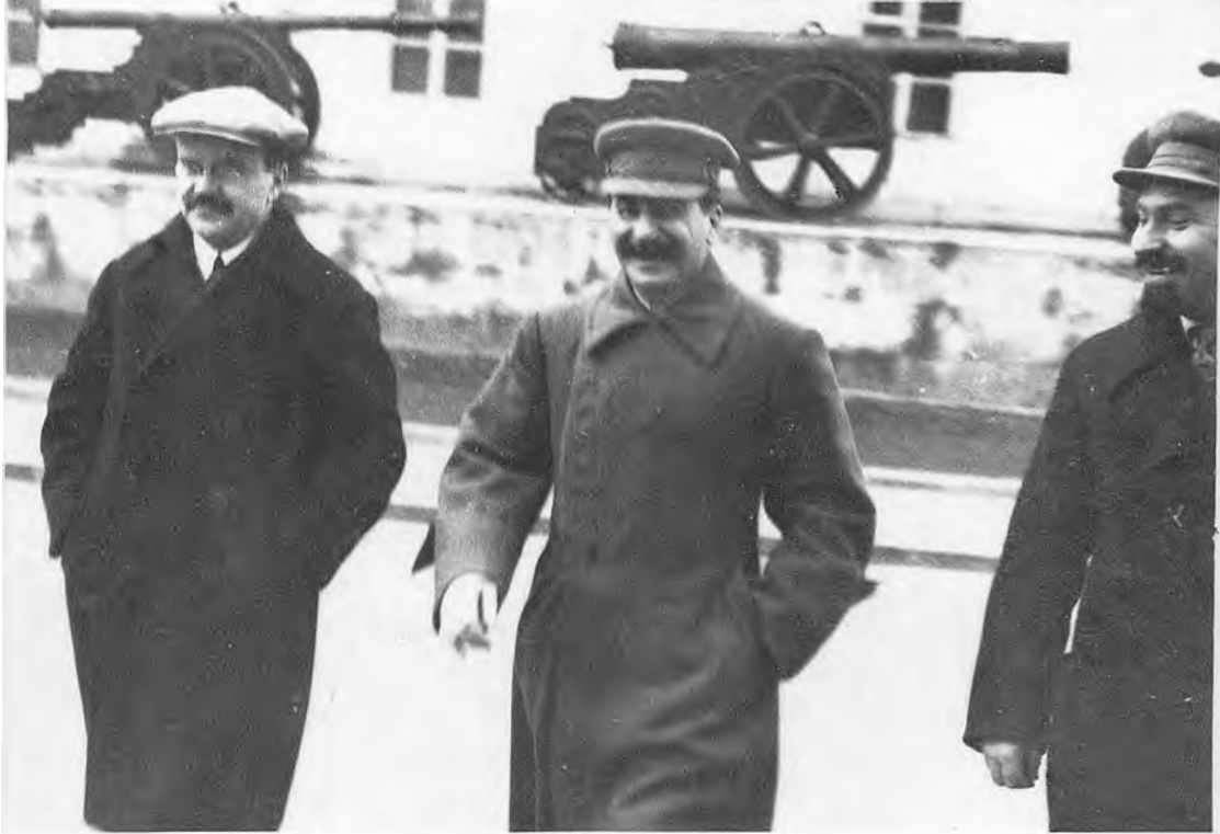
Molotov, Stalin and Kaganovich, 1 May 1932

The White Sea Canal under construction, with 'kulak' labour