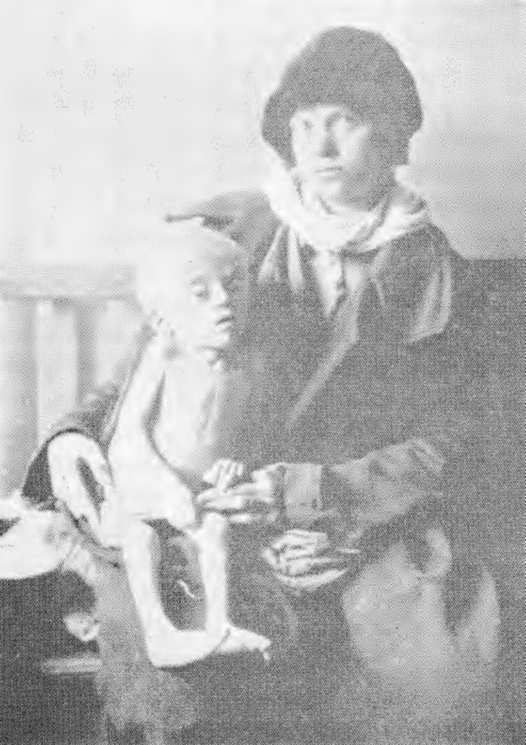
Near Kharkov: the child is the boy described on p286