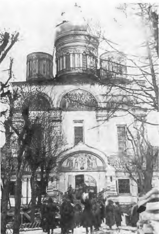
Demolition of the Seminova Monastery, 1930