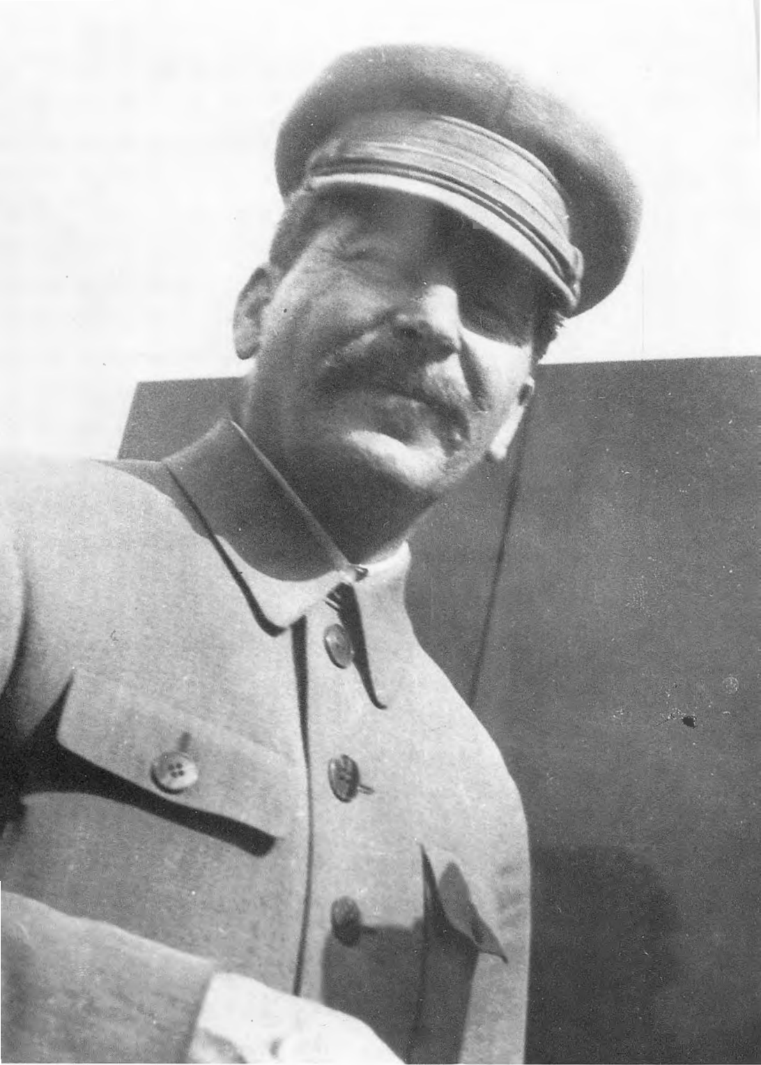
Stalin (c. 1934)