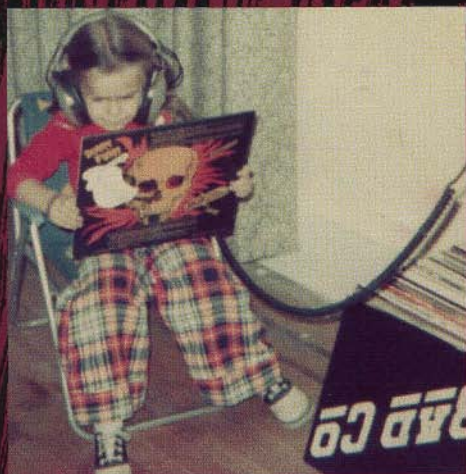
Famous psychic Edgar Cayce says that one can measure the spiritual temperature of a society by the music it creates.

own. This bothers certain members in my family who don't agree with my views, because they can't say that I learned them all from my father. I definitely came to be opinionated in my views all by myself, and my views are always still evolving.