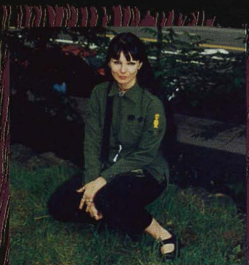
Enjoying the last bit of raw nature in Central Park in the middle of the multi-racial cesspool of New York City.

TM: What direction would you like to see Resistance Records and/or the National Alliance take to appeal to the mainstream White majority?