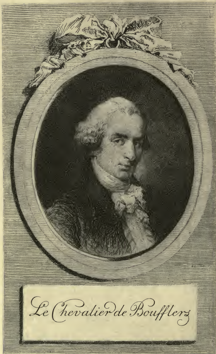
Le Chevalier de Boufflers