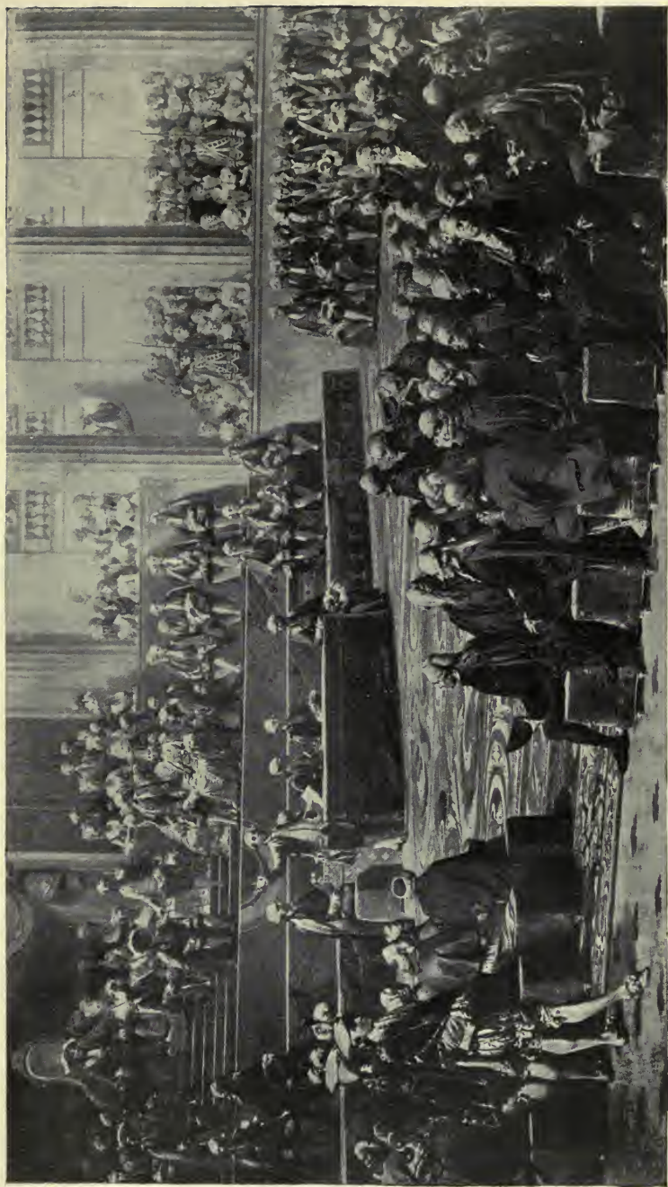
LES ÉTATS GÉNÉRAUX.