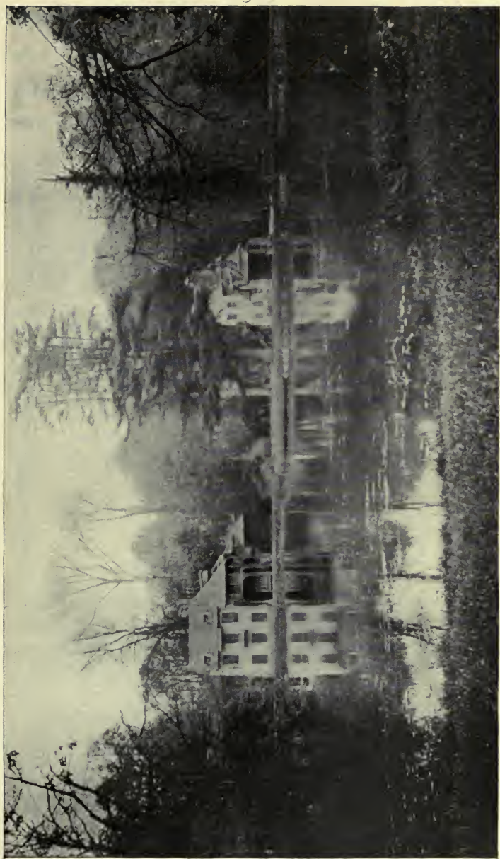
THE HAMEAU.