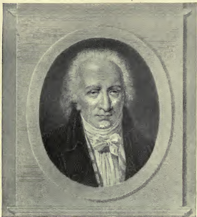
"LE PETIT PÈRE."