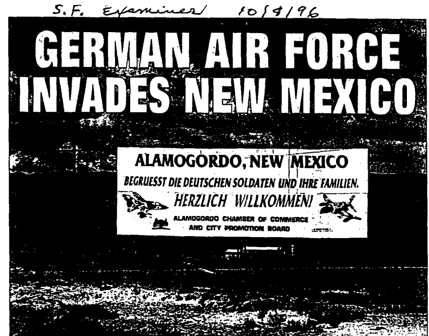
The Germans are paying millions of dollars for the base in Alamogordo that has WWII vets turning