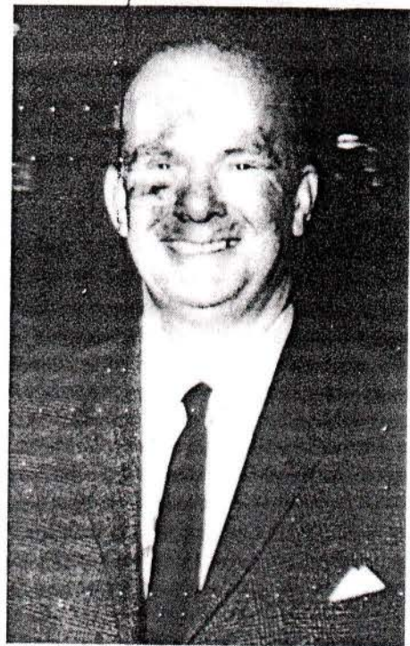
Walking wounded. Colin Jordan, British Nazi boss, injured after his men attacked an election meeting.

Top: a pro-IRA sticker published by "anti-fascist" Red Action. Bottom: Colin Jordan pictured after he was attacked by Jewish thugs in January 1965.