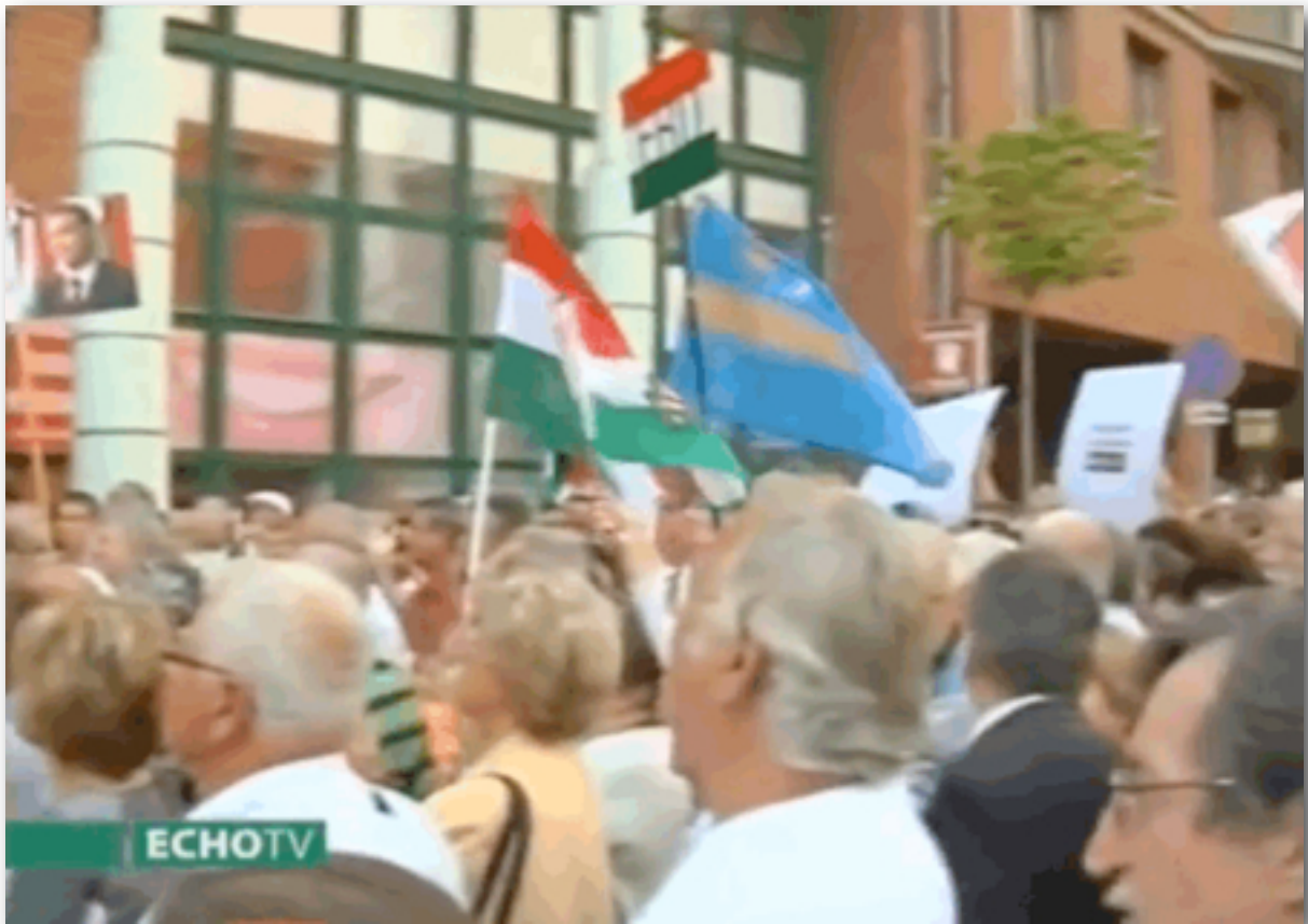
[Images] The crowd listening to Bayer's speech near the Soros funded magazine Magyar Narancs' building.