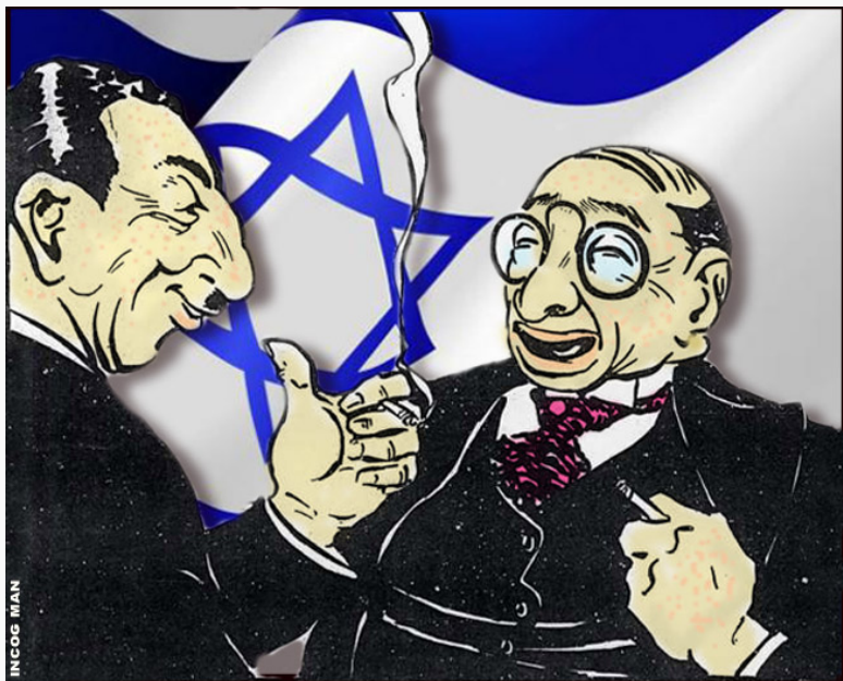
Zionism and Communism are but two arms of the Jewish World Swindle.

Jewish endeavor to usurp the remaining Gentile nations free from Jewish control, plunder their wealth, and enslave and murder the best of their people!