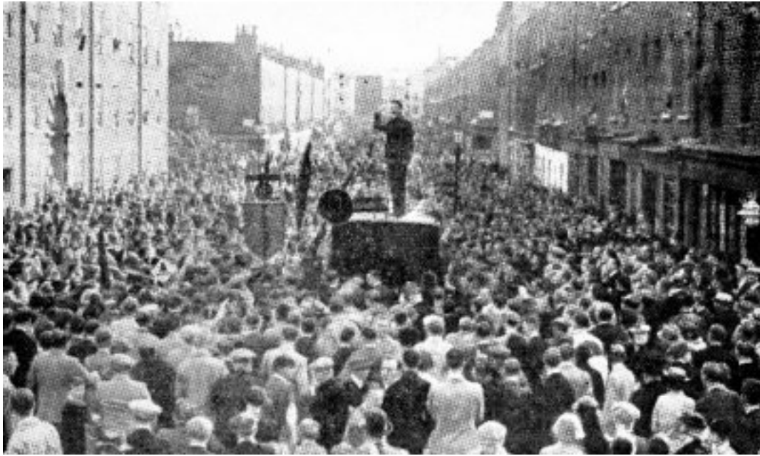
St Marylebone, 1938