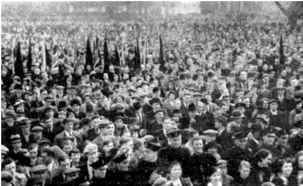
Victoria Park, Bethnal Green, 1936.