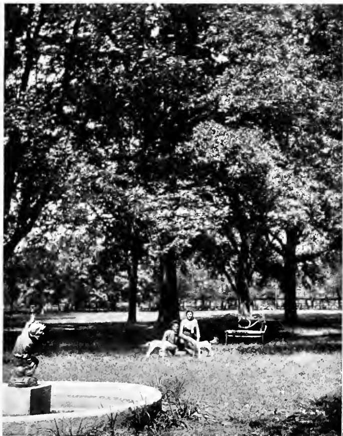
"THE OAKS AND ELMS I LOVE BEST"