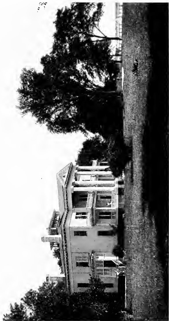
"A STately COLONIAL HOME TWO HUNDRED YEARS OLD"