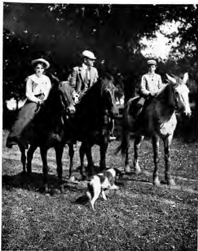
"ALL HAVE SADDLES AND RIDE LIKE VETERAN CAVALRYMEN"