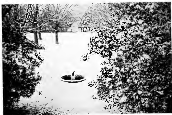
"THE ERMINE ROBE OF THE NORTH"