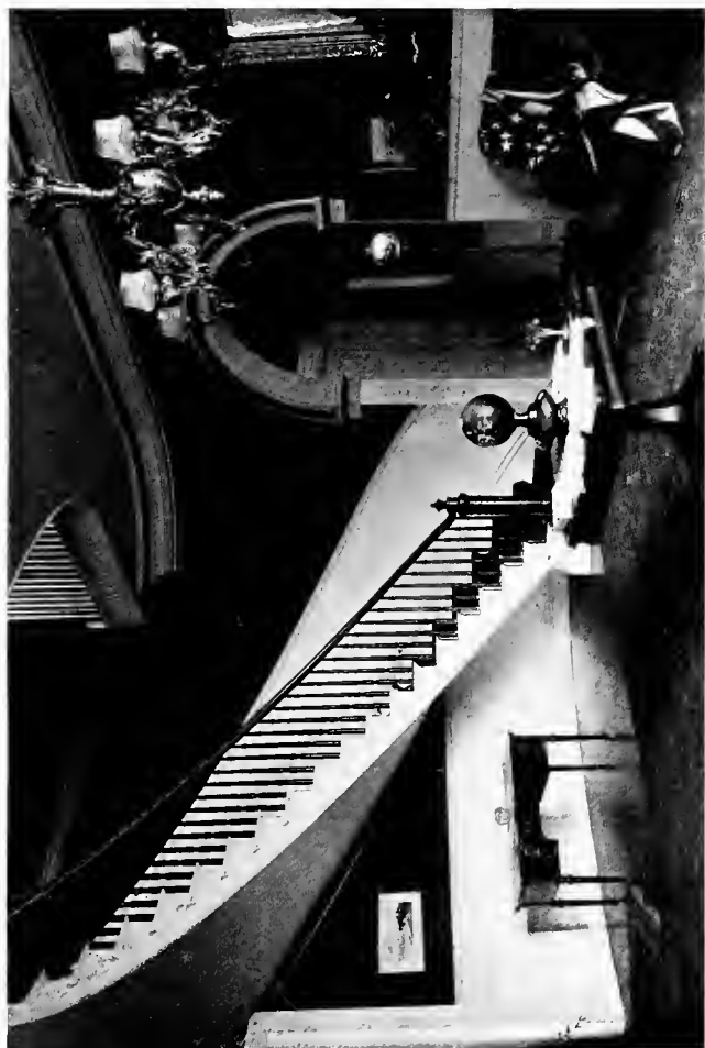
"ITS GREAT HALL"