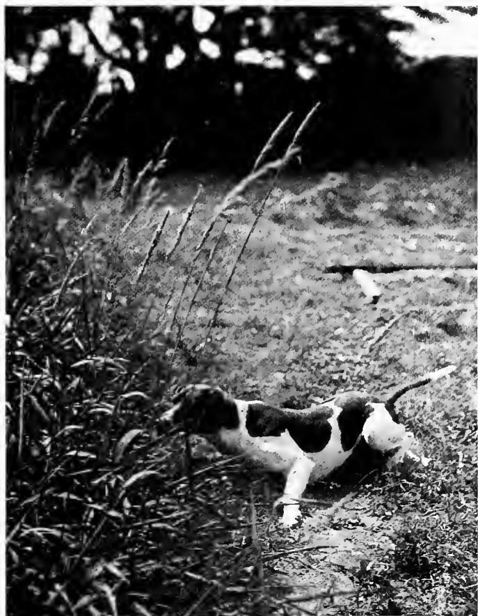
BOB ON A CLOSE POINT