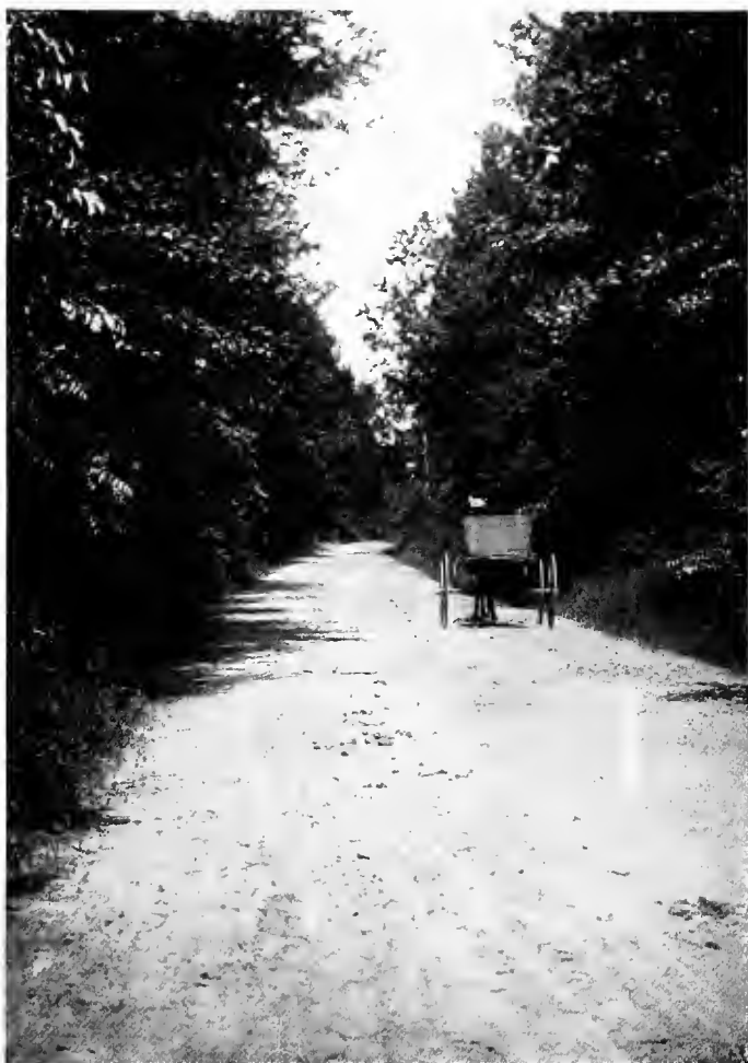
"THE DRIVES IN SUMMER ALONG THE COUNTRY ROADS ARE OF SURPRISING BEAUTY"