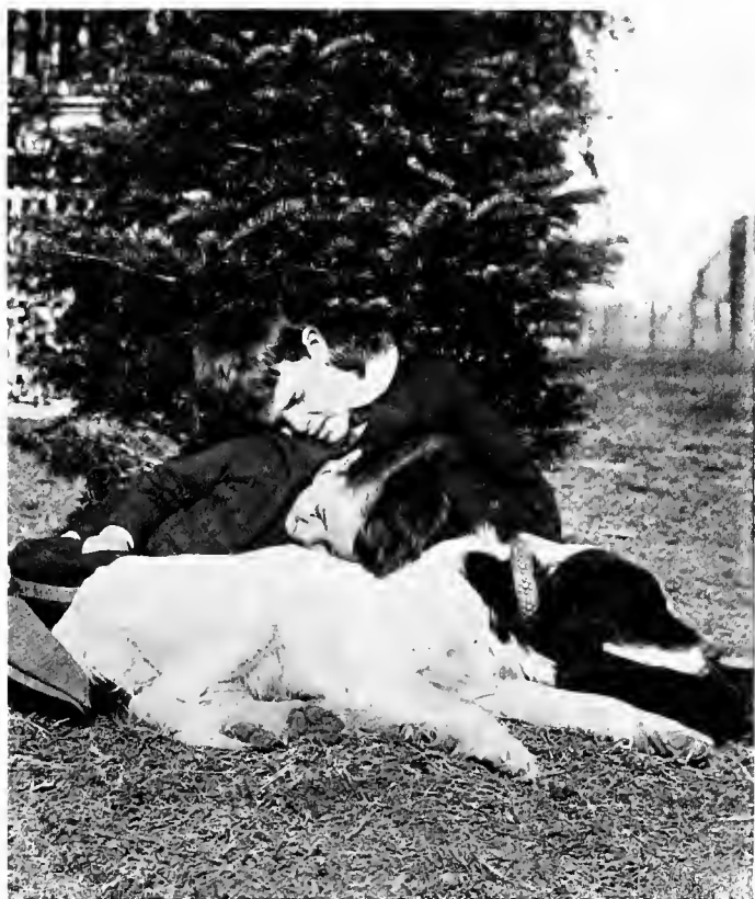
SAILOR AND THE BOYS IN PRIVATE THEATRICALS— “THE MYSTERY OF SLEEP”