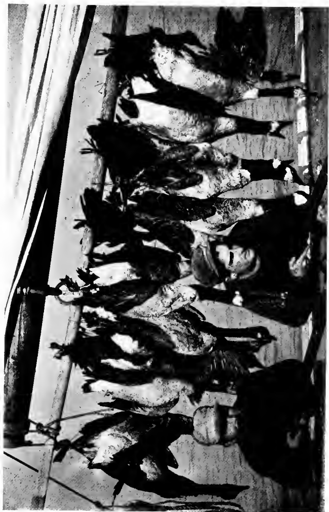
"GEORGE AND I CROUCHED AMONG THEM"