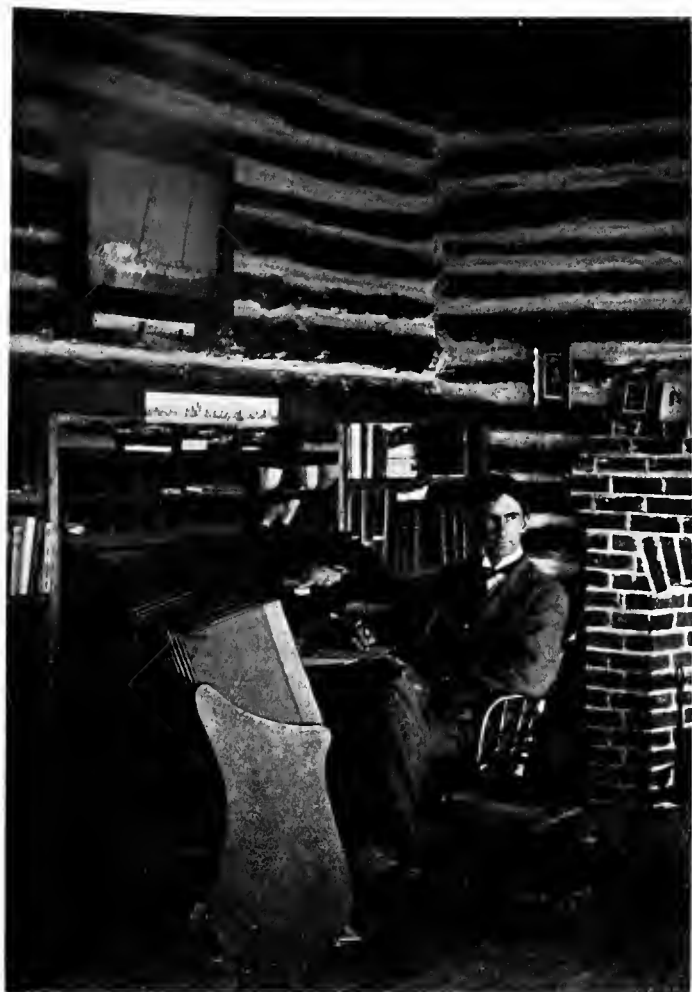
THE AUTHOR AT WORK IN HIS CABIN