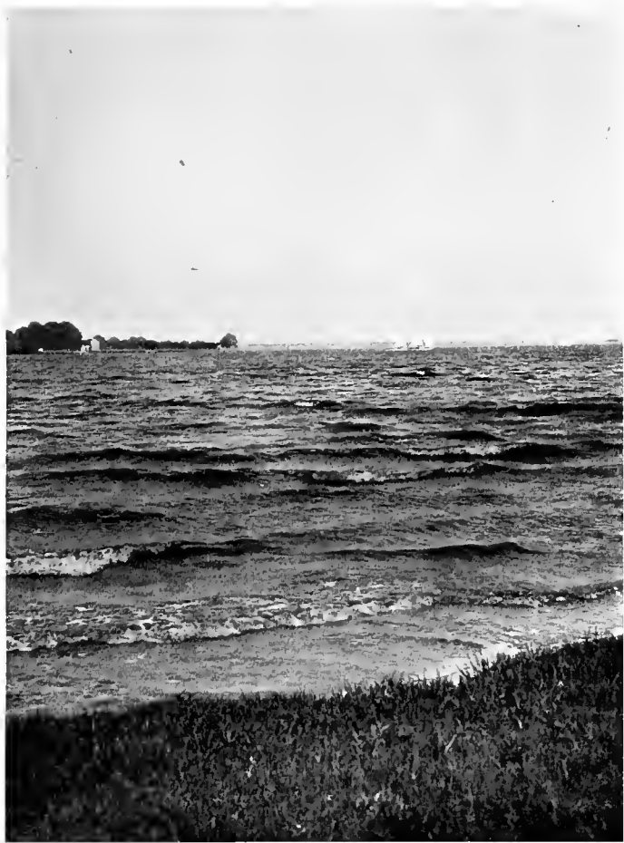
"THE GRASS OF THE LAWN ROLLS SHEER INTO THE DEAD LINE OF THE SALT TIDE"