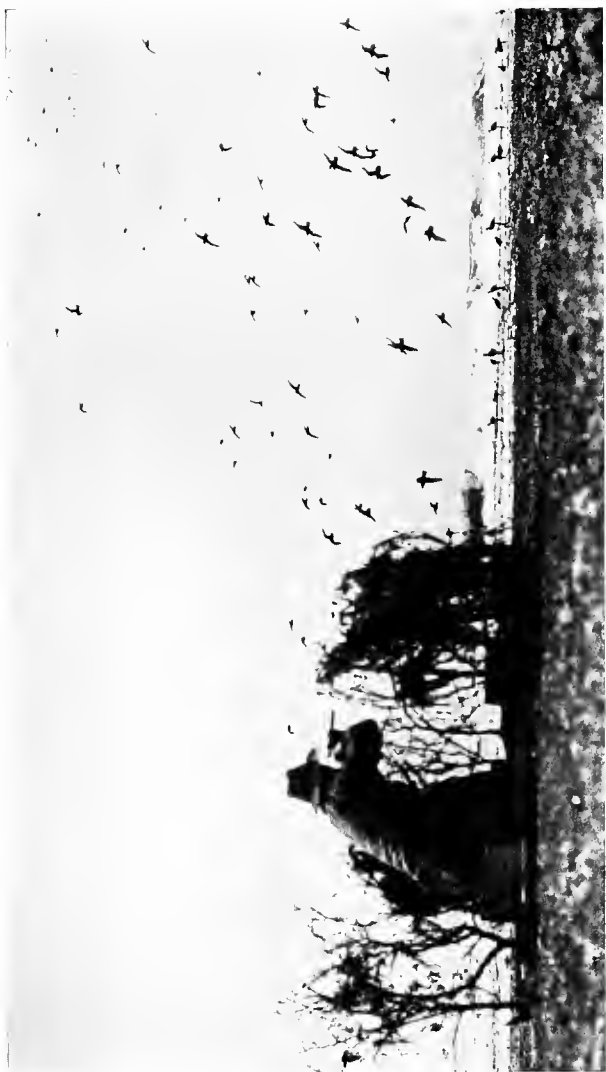
"SOMETIMES THE SKY IS BLACK WITH THEM"