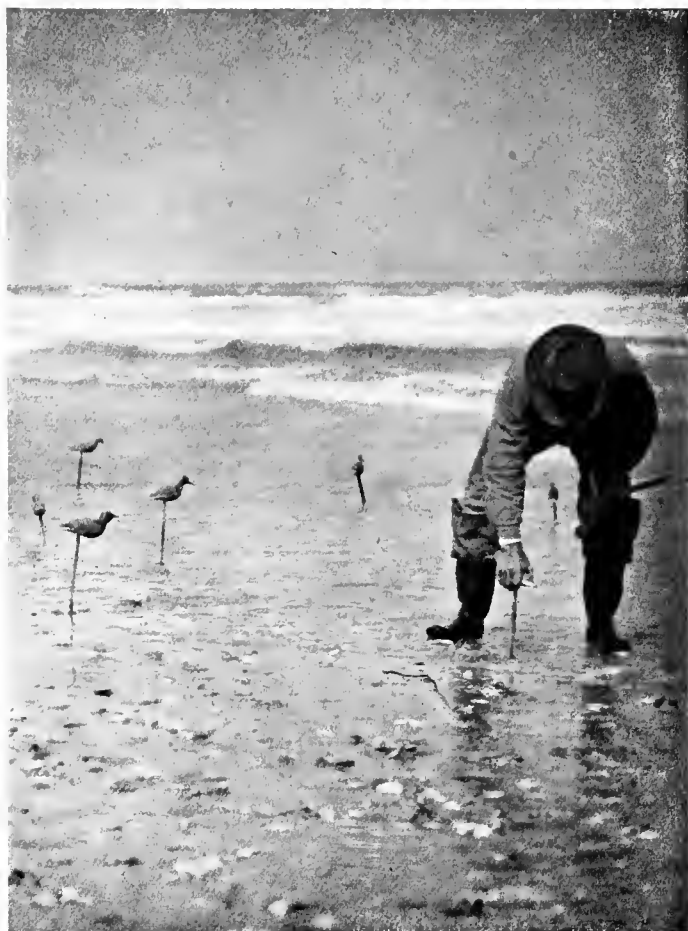
"PLACE OUR DECOYS ON THE EDGE OF THE RECEDING SURF"