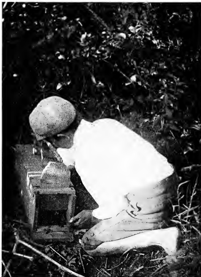
"ANOTHER PLEASURE OF MY BOYS IS THE WORK OF THE TRAPPER"