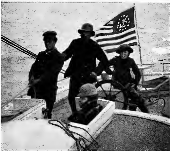
"WE ARE HOMEWARD BOUND NOW, WITH HER BIG YACHT ENSIGN SET AFT AND HER COLORS AT HER MASTHEAD"