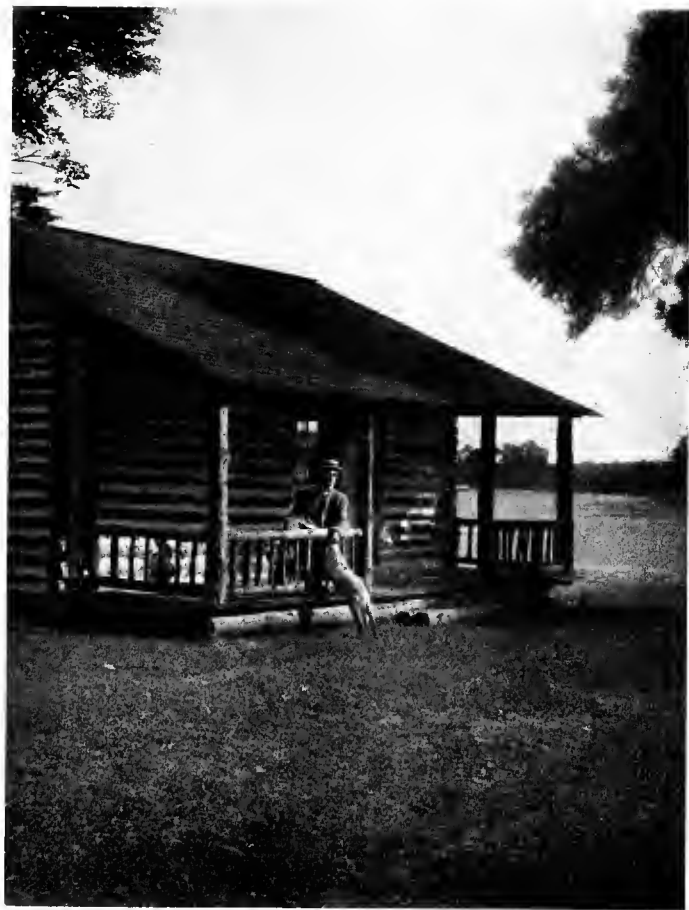
THE LOG-CABIN STUDY ON THE EDGE OF THE LAWN