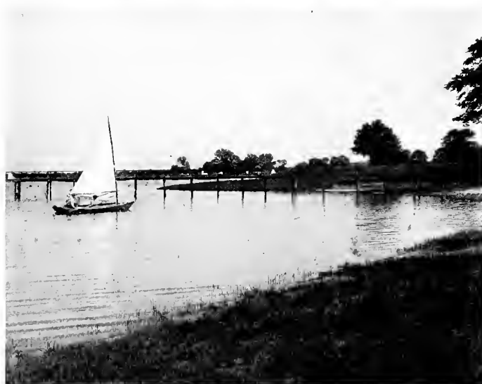
“WE HAVE A BEAUTIFULLY CURVED SAND BEACH ON THE LAWN”