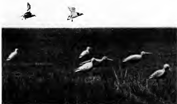
"AWAY OVER THE ENDLESS MARSH"