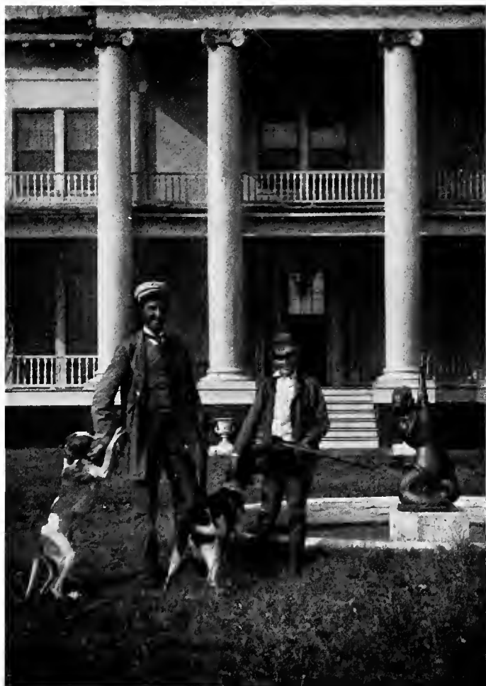
"I BELIEVE IN THE GUN FOR A NORMAL BOY"