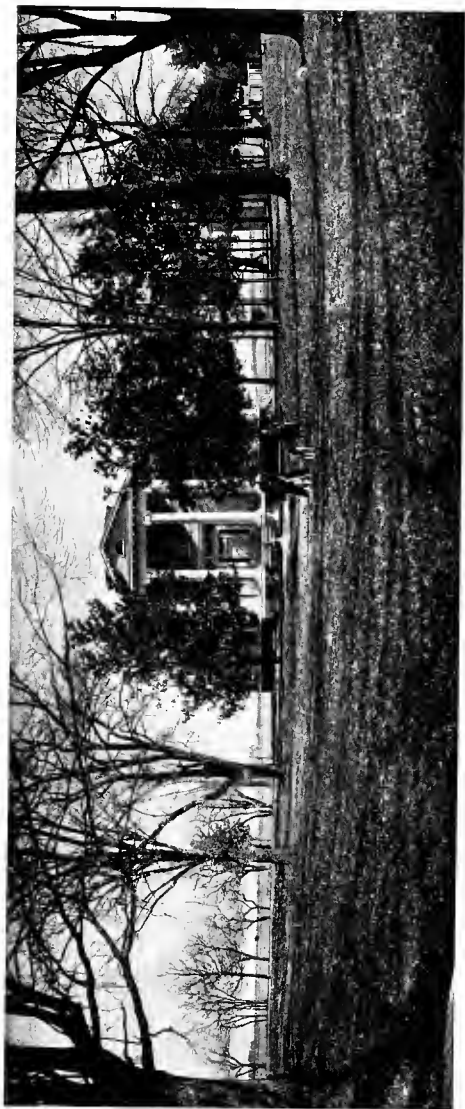
"THE LAWN IS NEVER QUITE BARE"