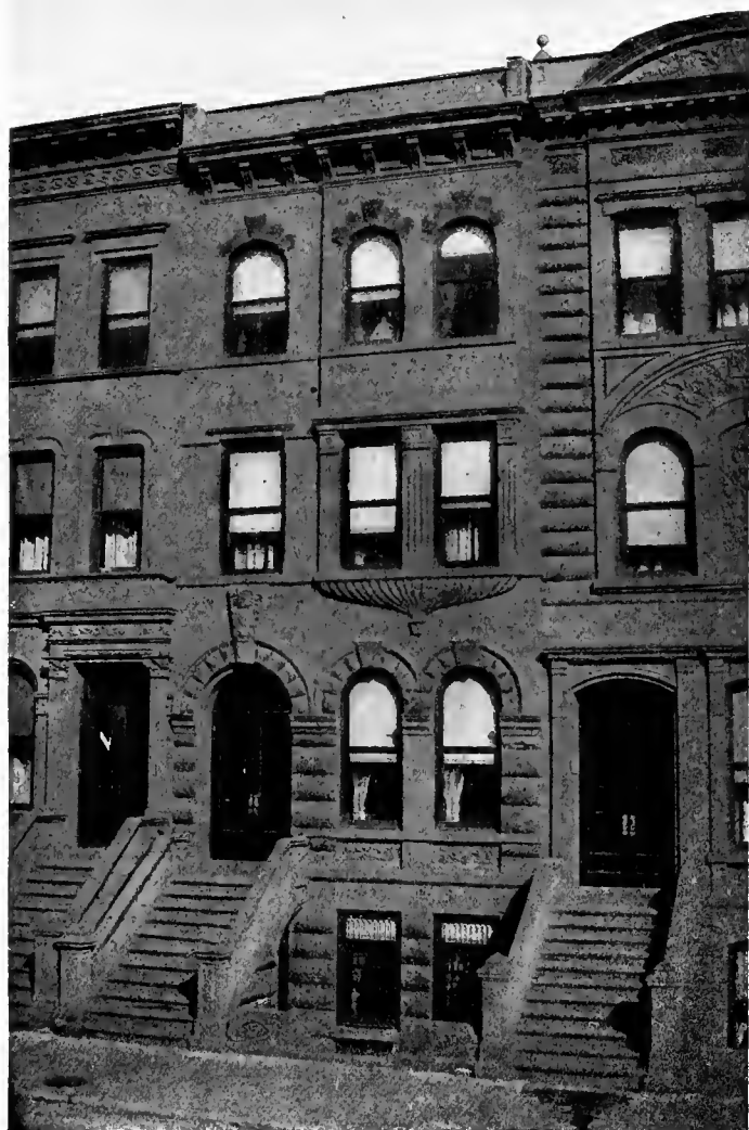
“JUST A NINETEEN-FOOT SLIT IN A BLOCK OF SCORCHED MUD WITH A BROWNSTONE VENEER”