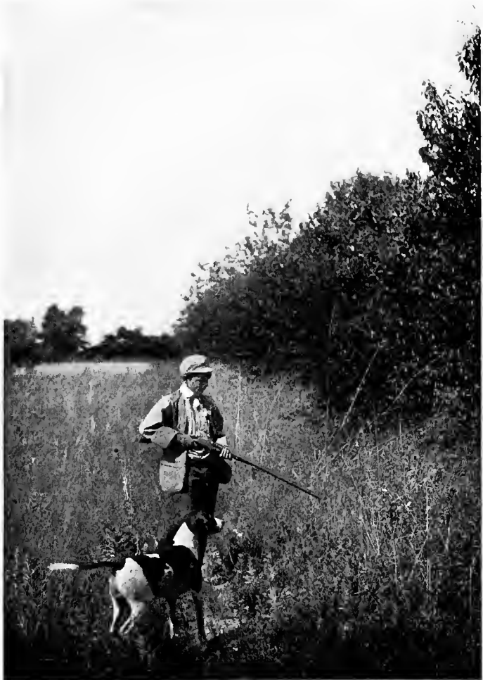
"THE FIRST MAN WAS A HUNTER"