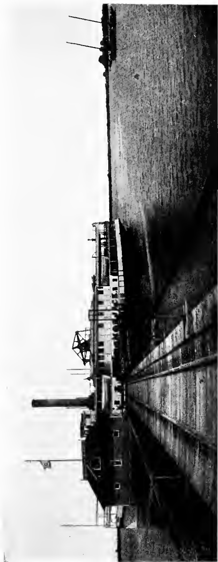
"THE OLD DOMINION STEAMER HAS AN ARTISTIC LITTLE PIER ON THE UPPER END OF THE LAWN."