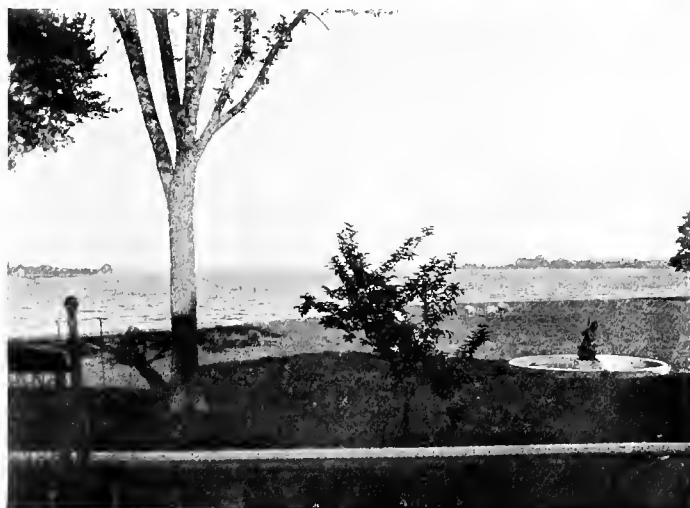
"THROUGH THE SHADOWS OF THE TREES THE WATERS GLEAM"