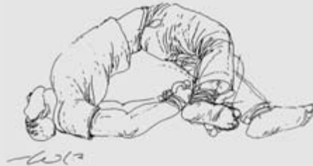
Figure 4. The "banana" tie. Illustration by David Gerstein from B'Tselem, Interrogation of Palestinians during the Intifada .