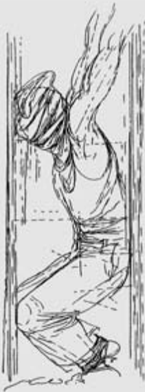
Figure 3. The "closet." Illustration by David Gerstein from B'Tselem, The Interrogation of Palestinians during the Intifada: Ill-treatment, "Moderate Physical Pressure" or Torture? (Jerusalem, 1991).

The interrogators beat the suspects on the face, the chest, the testicles, the stomach, in fact on all parts of the body. In the course of the beatings, the detainees' heads are sometimes smashed against the wall or the floor and they are kicked in their legs.