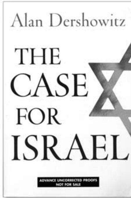
Exhibit B. Cover from advance page proofs for Alan Dershowitz's The Case for Israel .

mentioned, the scholarly consensus is that her demographic findings were sheer fraud: Palestine was “underpopulated” only by “modern standards . . . where rapid population growth is endemic”; there is no evidence of any significant Arab internal migration in Palestine due to Zionist enterprise; there is no evidence of any significant Arab immigration into Palestine during the Ottoman or British Mandate period. Peters managed to “prove” her thesis only by mangling documents and falsifying numbers. 6 Returning to The Case for Israel , Dershowitz writes that Palestine was “vastly underpopulated” when the Zionist settlers came (p. 23), while in a publicity interview for the book, he flatly stated