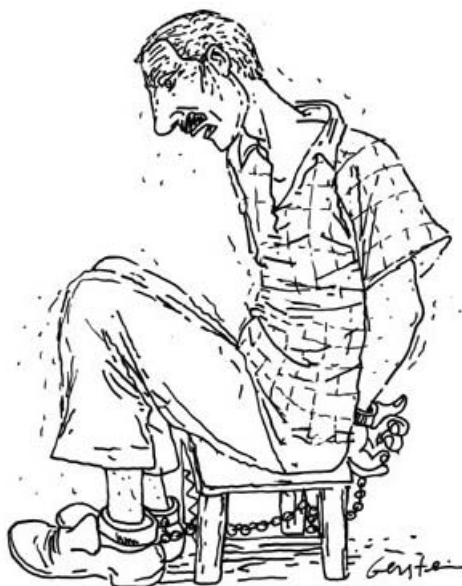
Figure 6. “Shabeh,” a standard torture technique. Public Committee Against Torture in Israel, Back to a Routine of Torture , p. 55.