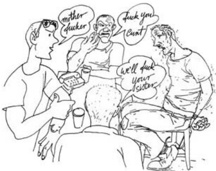
Figure 5. Humiliation during interrogation. Public Committee Against Torture in Israel, Back to a Routine of Torture: Torture and Ill-treatment of Palestinian Detainees during Arrest, Detention and Interrogation, September 2001–April 2003 (Jerusalem, April 2003), p. 51.