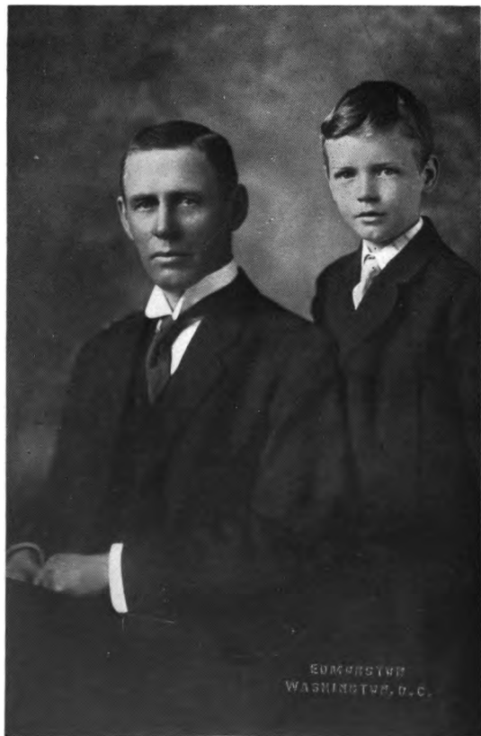
CHARLES A. LINDBERGH AND SON, CHARLES A., JR.