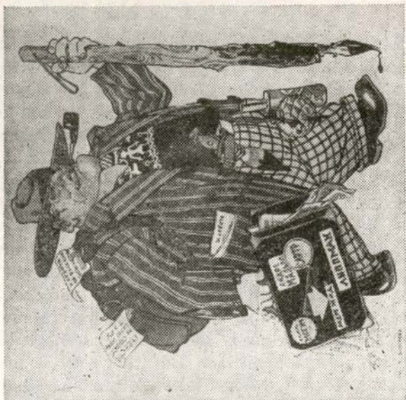
This reproduction is from the original as it appeared in the March 20 issue of Krokodil. The arrow clearly shows the name "Andre Zhid," which is the Russian transliteration for Andre Gide, French writer.