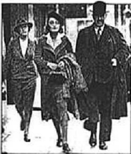
Here is another woman leaving the British Union headquarters with a suitcase and a woman after other members' had in the office.

The search was made in the early hours of the morning. The search was made in the early hours of the morning. The search was made in the early hours of the morning. The search was made in the early hours of the morning.