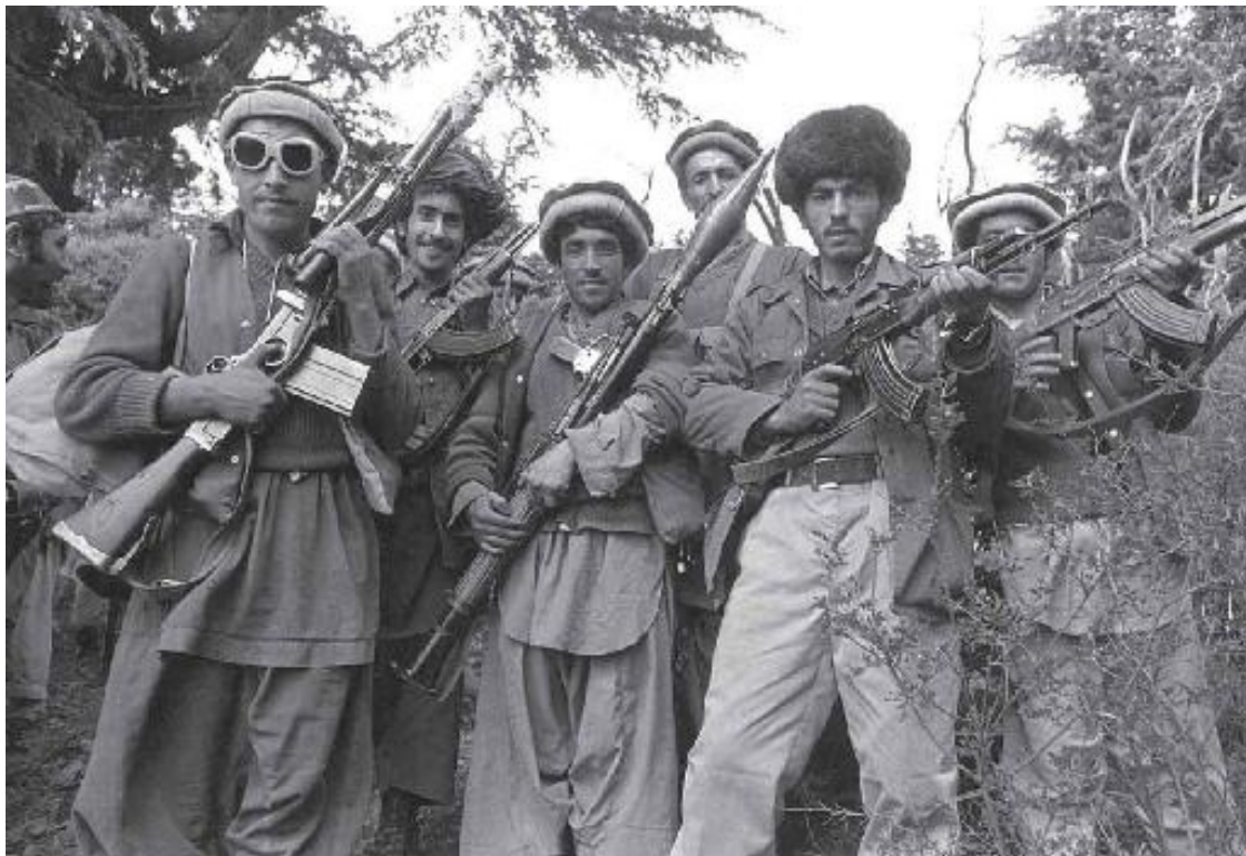
CIA backed Mujahideen, Kunar province. Afghanistan 1985.

After the Soviet Union invaded Afghanistan in December 1979, President Carter directed CIA to assist the Afghan Mujahideen. CIA came to see that the indigenous Afghan opposition to the Soviets was less an organized movement than widespread opposition by villages and tribes. Through Pakistan, CIA provided the Mujahideen with money, weapons, medical supplies, and communications equipment. Initially the goal was to drain Soviet resources by keeping their forces bogged down. In 1985, CIA shifted from a plan of attrition to one that would help the rebels win. One of the pivotal moments came in September 1986, when the Mujahideen used CIA-provided Stinger missiles to shoot down three Soviet Mi-24D helicopter gunships. As part of this escalation of financial and material support, President Reagan issued new guidance that put the CIA into more direct contact with rebel commanders, beginning an era of CIA interaction with tribal and local leaders that continues through the post-9/11 era. 9