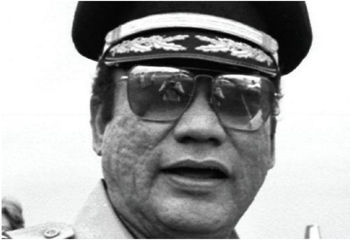
General Manuel Noriega military dictator of Panama from 1983 to 1989.

1 Shlomo Avineri, Moses Hess: Prophet of Communism and Zionism (New York: New York University Press, 1985), 246.