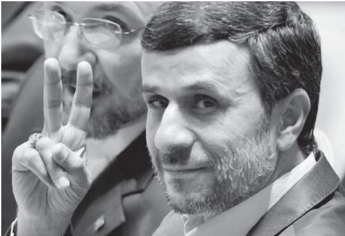
President Mahmoud Ahmadinejad gestures as he attends the United Nations General Assembly

As if it weren't enough being the leader of a large Islamic nation that does not kowtow to the USA and to Israel, Dr Ahmadinejad put himself beyond redemption for eternity by suggesting that "holocaust revisionism" should be subjected to the same standards of scholarly scrutiny as any other historical matter, 1 and like the Left-wing Jewish academic Prof. Norman G Finkelstein, suggested that the holocaust was being exploited for political and economic motives. 2 Being Jewish, Left-wing and the son of parents who had survived both the Warsaw Ghetto and Nazi concentration camps, 3 didn't save Finkelstein from the Zionist smear-brigade, so Dr Ahmadinejad is not about to be cut any slack.