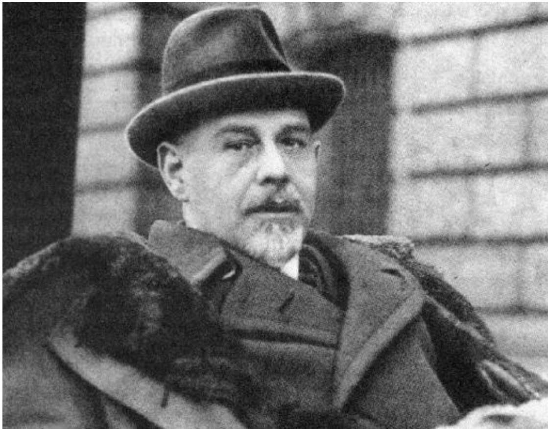
Walther Rathenau was a German industrialist, writer, and statesman who served as Foreign Minister of Germany during the Weimar Republic.

The Jews of anti-Semitic stereotype were conspicuous. They were guilty of playing into the hands of uncompromising anti-Semites, which also suited the agenda of the then insignificant Zionist movement in Germany. Indeed, from the birth of the Zionist movement, there has always been a symbiosis between anti-Semitism and Zionism to the point where Zionist agencies have provided the mainstay for neo-Nazi groups. 9 As will be seen here, briefly, the same symbiosis existed between the National Socialist party and the Zionists in Germany while both repudiated the German nationalists of Jewish descent. Until then, Zionism had received such opposition from Jews in Germany that Herzl's original plans to hold the First Zionist Congress in Munich had to be changed to Basel. 10