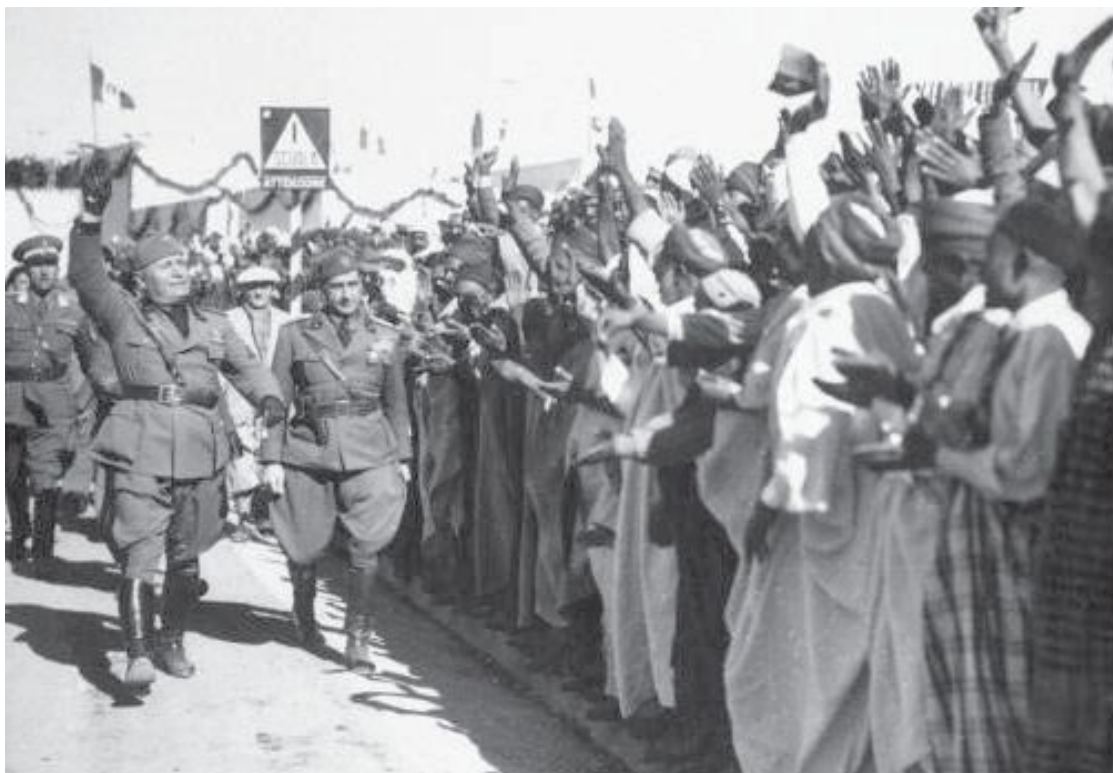
Benito Mussolini waving to resident Muslims in Tripoli, Libya. 1937.