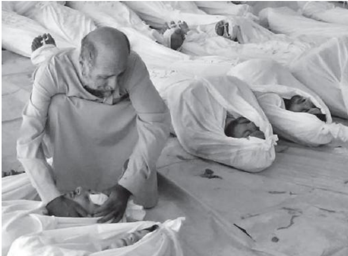
A Syrian man mourns over a dead family member after a poisonous gas attack in Damascus, Syria in August 2013.

The plan of attack against Syria has been long in the making. Arab regimes have recently fallen like dominoes as a prelude to the elimination of Syria and Iran. The Clean Break recommends the use of Cold War type rhetoric in smearing Syria. We can see the plan unfolding before our eyes. The “weapons of mass destruction” charade used to justify the US bombing of Syria takes the form of alleged chemical attacks on Syrian “civilians,” with a compliant news media showing lurid pictures of suffering children, but usually with the comment that the reports are “unconfirmed.” The US assurances of “proof” sound as unconvincing to the critical observer as the “evidence” against Saddam. The United Nations supposedly has a report proving that chemical weapons were used, but not who used them. Sure enough, reports have come out that US-backed rebels have committed the chemical attacks as a means of securing a US assault on the Assad government. Two Western veteran journalists, while captives of the Free Syria Army, overheard their captors – including an FSA General - discussing the chemical weapons attack rebels had launched in Damascus as a means of justifying Western intervention. 5