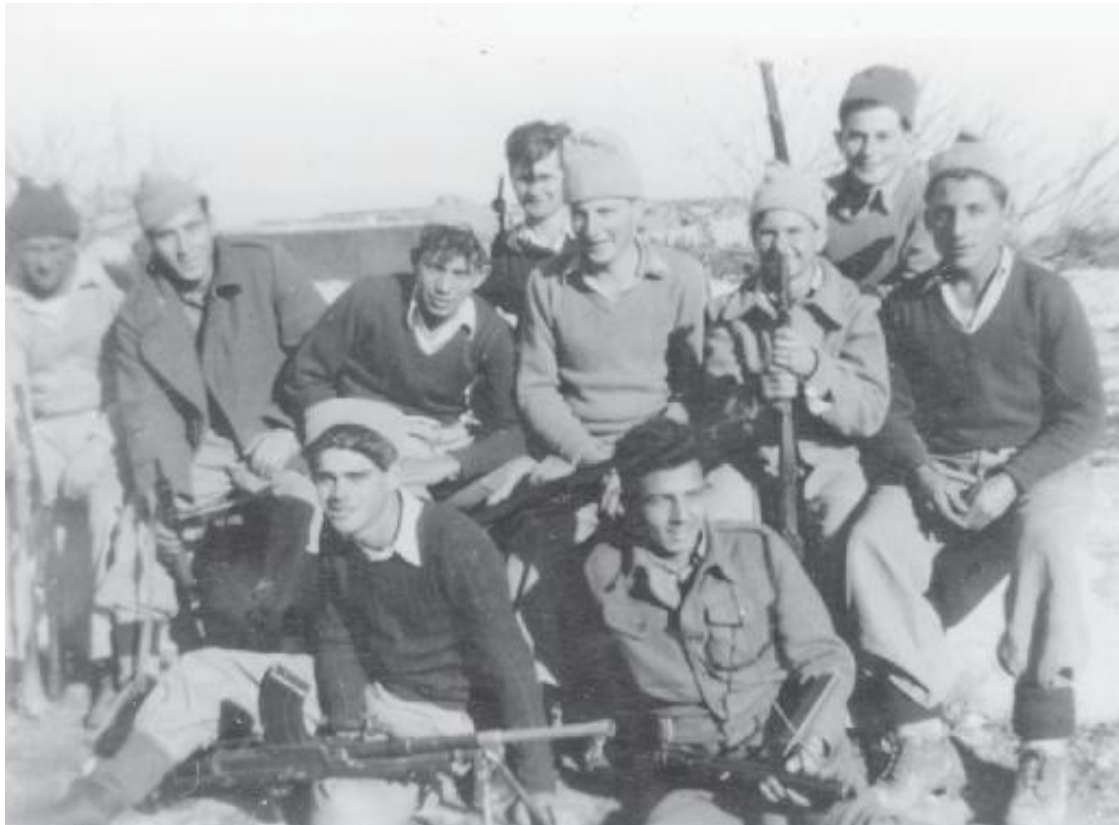
Members of a Palmach military unit Palestine 1948.

The USSR provided the wherewithal for the Zionist underground, including not only weapons but also training. At the time The New York Herald Tribune ran a report on the “Stern Gang” which identified this extreme Zionist terrorist faction as having communist origins: