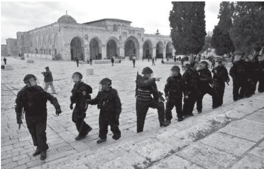
Al Aqsa Mosque, Jerusalem: Zionists plan to re-build the Temple of Solomon over its ruins as the centre of a Zionist World Empire.

It is apt to recall the present Jihad bogeyman arose from the Mujahideen, which was formed by the CIA as a guerrilla force against the Russians in Afghanistan. The “clash of civilizations,” as neocon historians refer to the “war on terrorism,” was a contrivance; not the result of an inexorable historical law. By the end of the First World War much goodwill existed between the Entente and the Arabs who had fought together against the Ottoman Empire, with the expectation that the Arab states would achieve independence, thanks to the heroic efforts of T. E. Lawrence and the Arabic fighters. Their guerrilla war against the Turks had been crucial to the war effort, although subsequently besmirched by Zionist propagandists. 1 Thanks to Zionist machinations, the Entente had spoken with a forked tongue to the Arabs while making a contrary promise to the Zionists to back a Jewish state in Palestine in return for Jewish influence supporting the Entente cause, by then in a predicament, in the USA. The result was the Balfour Declaration and the needless prolongation of the war 2 so that the Zionists and the messianists could get their nose poked into Palestine until such time as being able to dump themselves en masse after the Second World War.