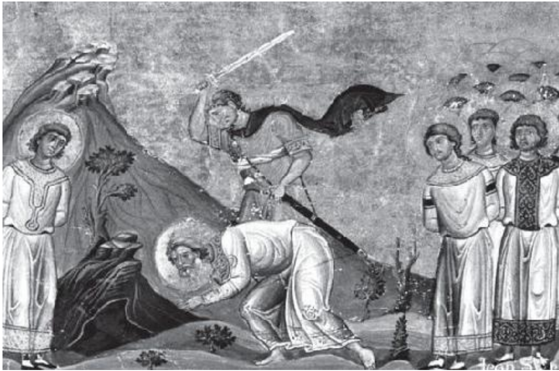
Saint Arethas and the Martyrs of al-Najran from the Menologion of Basil II.

A difference between Islam and Judaism is that whereas the Koran honour Jesus as a prophet and his mother Mary, the Orthodox Jewish Talmud , or religious codex, describes them in what we might call less than flattering terms. Hence, Islam honors the Christian martyrs of Najran, the Koran stating of them: