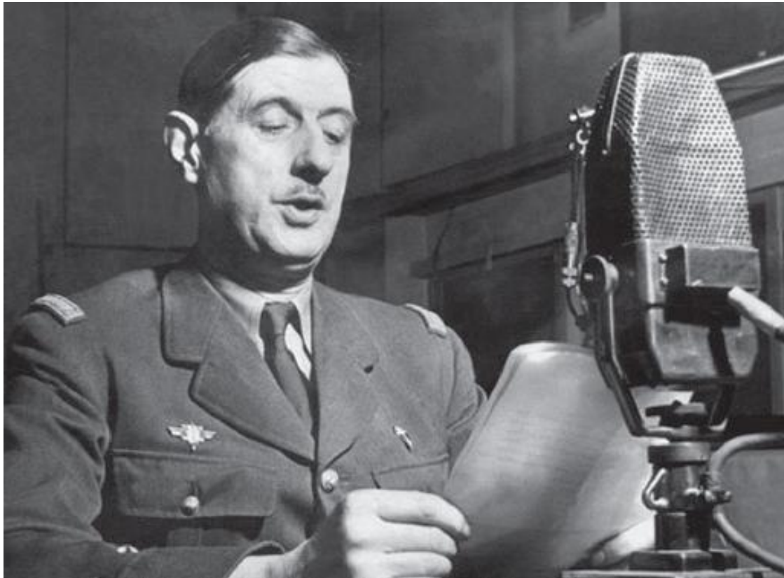
General De Gaulle in a BBC radio broadcast during WW2.