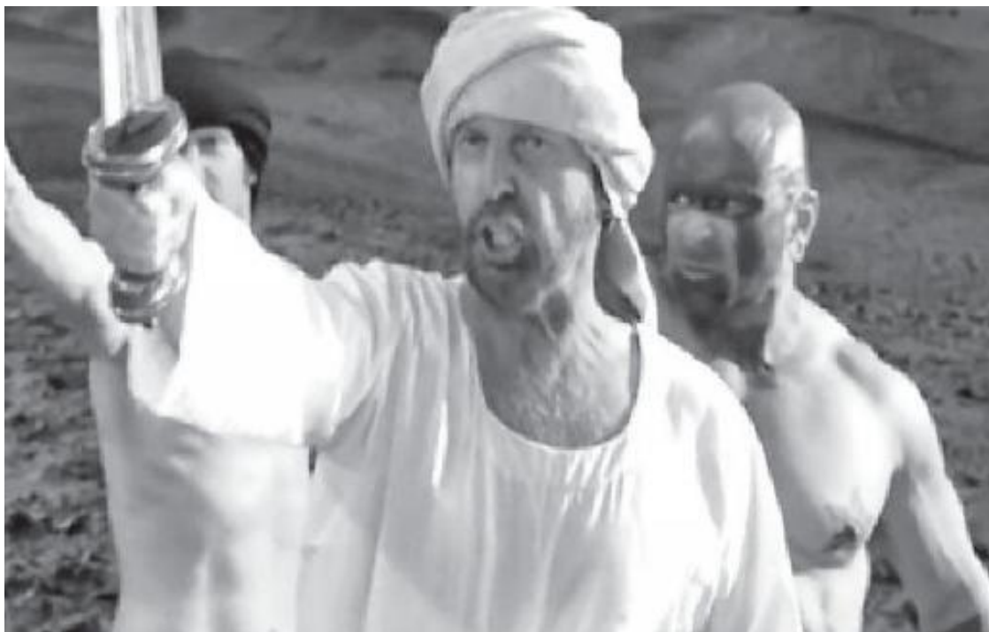
Scene from The Innocence of Muslims.