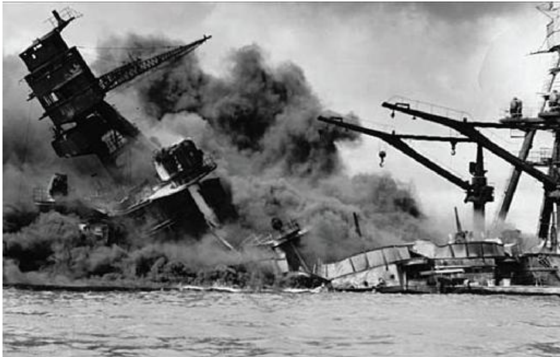
The destruction of the USS Arizona at Pearl Harbor - 7th December 1941.