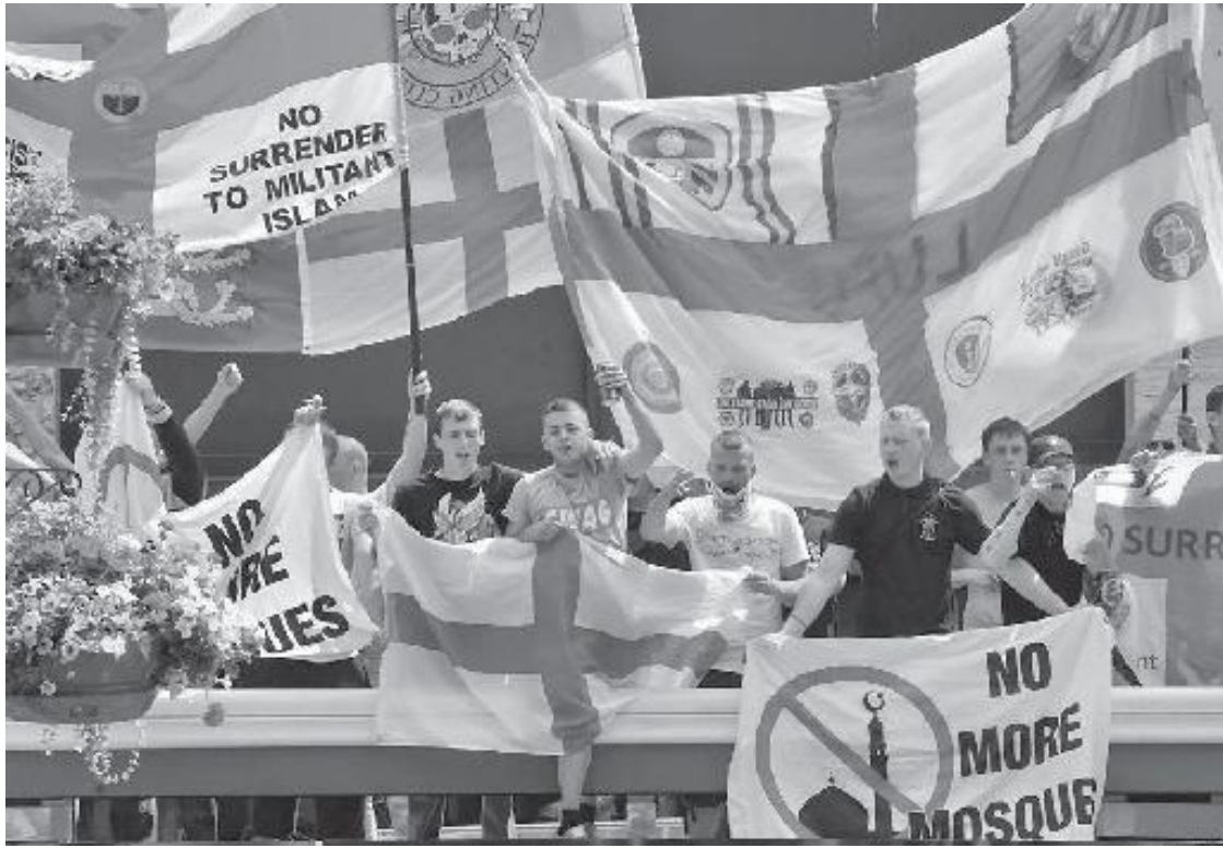
English Defence League protestors in Birmingham, England.