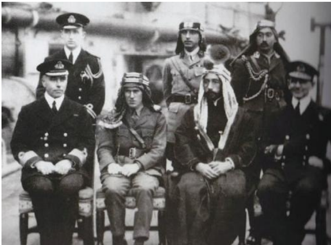
T.E. Lawrence and Prince Faisal aboard a British warship 1918.

The Bolsheviks in the newly formed Soviet Union, eager to present themselves as the leaders of a world revolt against European colonialism, released the details of the Sykes-Picot Agreement, and the Turks took the matter to the Arabs in February 1918, stating that they were now willing to recognise Arab independence. Hussein sought clarification from Britain, and Lord Balfour replied that: “His Majesty’s Government confirms previous pledges respecting the recognition of the independence of the Arab countries.” 15 In 1918 Arab leaders in Cairo sought clarification from Britain and the British “Declaration to the Seven” on June 16 confirmed the previous pledge that had been made to Hussein. 16