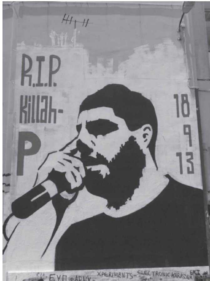
Mural for slain antifa rapper Pavlos Fyssas (Killah P) in Athens.

Matters grew more serious on September 18, 2013, when the anti-fascist rapper Pavlos Fyssas (Killah P) was stabbed to death by Golden Dawn members after he watched a football game at an Athens café. The murder sparked outrage across the country as anti-fascists shouting “Kill fascists in every neighborhood” clashed with police, while in the public sector a general strike was called. Anti-fascists targeted cash-for-gold shops particularly, because many of them were allegedly owned by Golden Dawn members with links to organized crime. 282