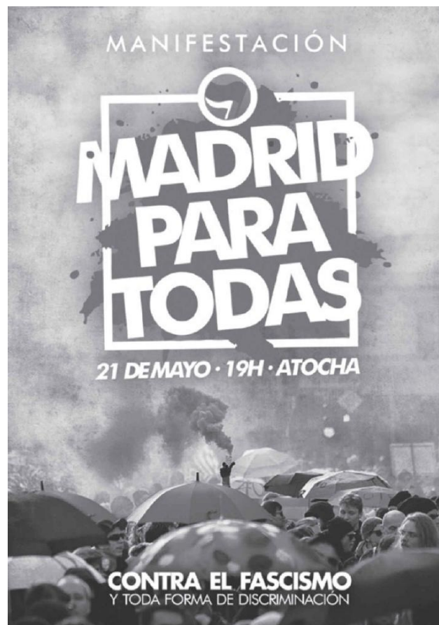
Madrid para todas poster, 2016. “Against fascism and all forms of discrimination.” [MADRID PARA TODAS]