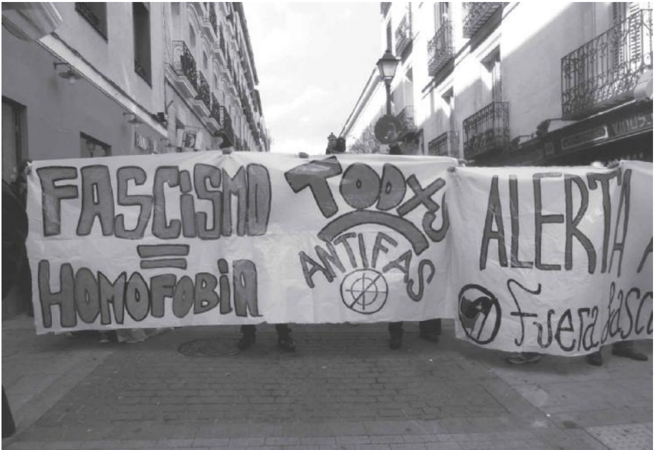
Madrid antifa demo May 1, 2013.

weapons charges, which caused the group to turn in on itself and subsequently collapse. 400