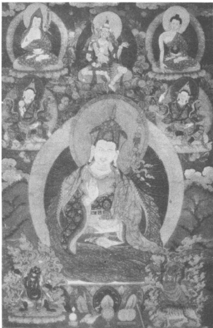
THE EIGHT GURUS Described on pages xxi–xxiv