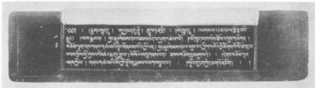
MAÑJUSHRĪ'S BOOK OF DIVINE WISDOM Described on pages xvii–xix