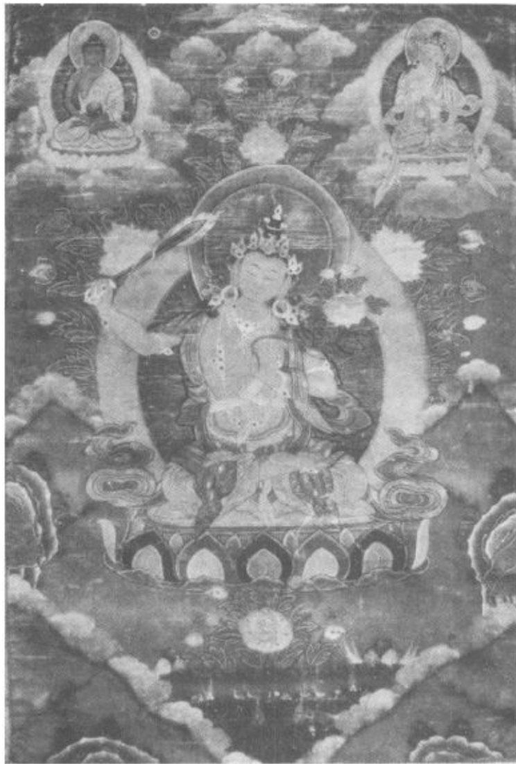
MAÑJUSHRĪ THE GOD OF DIVINE WISDOM Described on pages xix–xxi