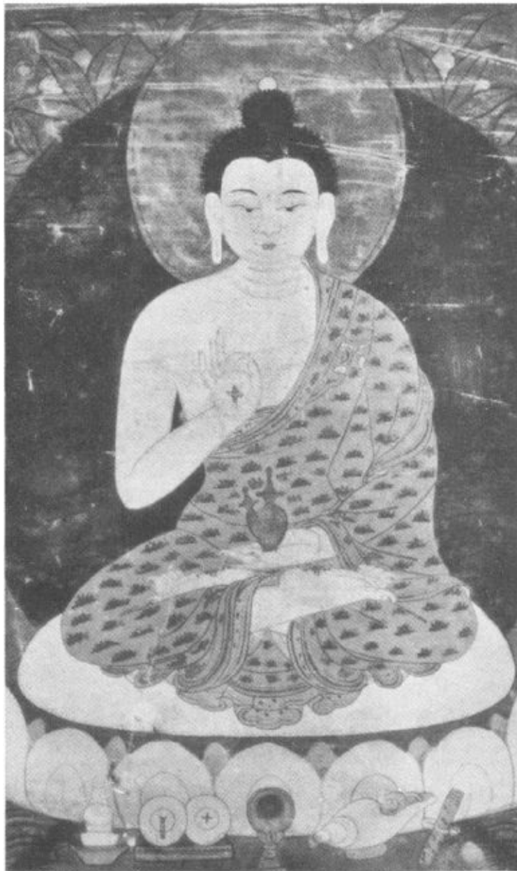
MAITREYA THE COMING BUDDHA Described on page xxvii–xxvii