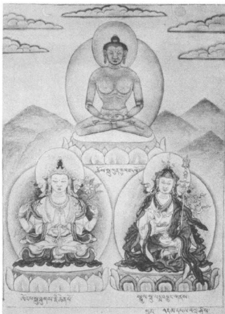
THE TRI-KĀYA OR THREE DIVINE BODIES Described on pages xxvi–xxvii