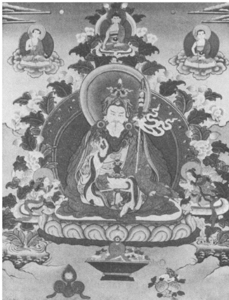
THE GREAT GURU PADMA-SAMBHAVA Described on pages xv–xvi