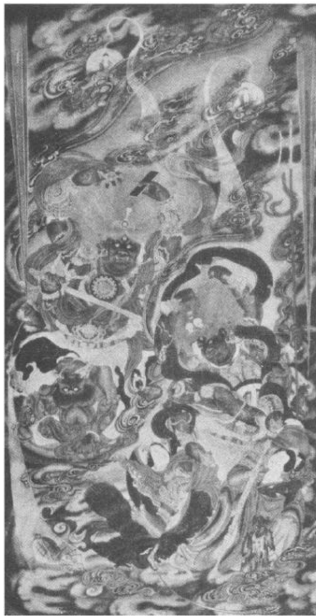
EMANATION Described on pages xxiv–xxvi