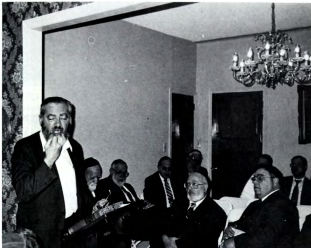
Meir Kahane raising money among Brooklyn's Syrian Jewish community, 1987.