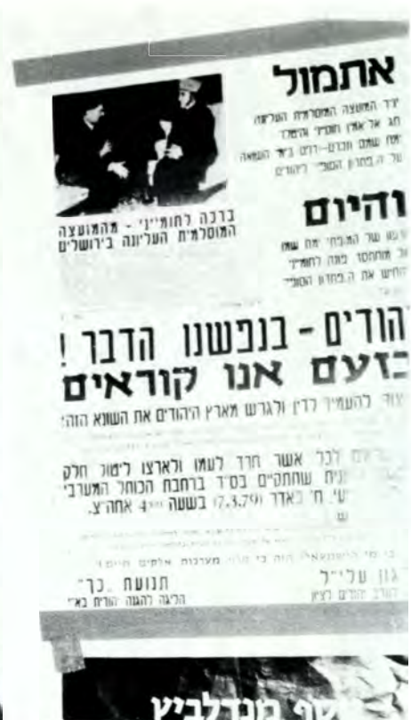
Meir Kahane in his Jerusalem office, The Museum of the Potential Holocaust, 1979.