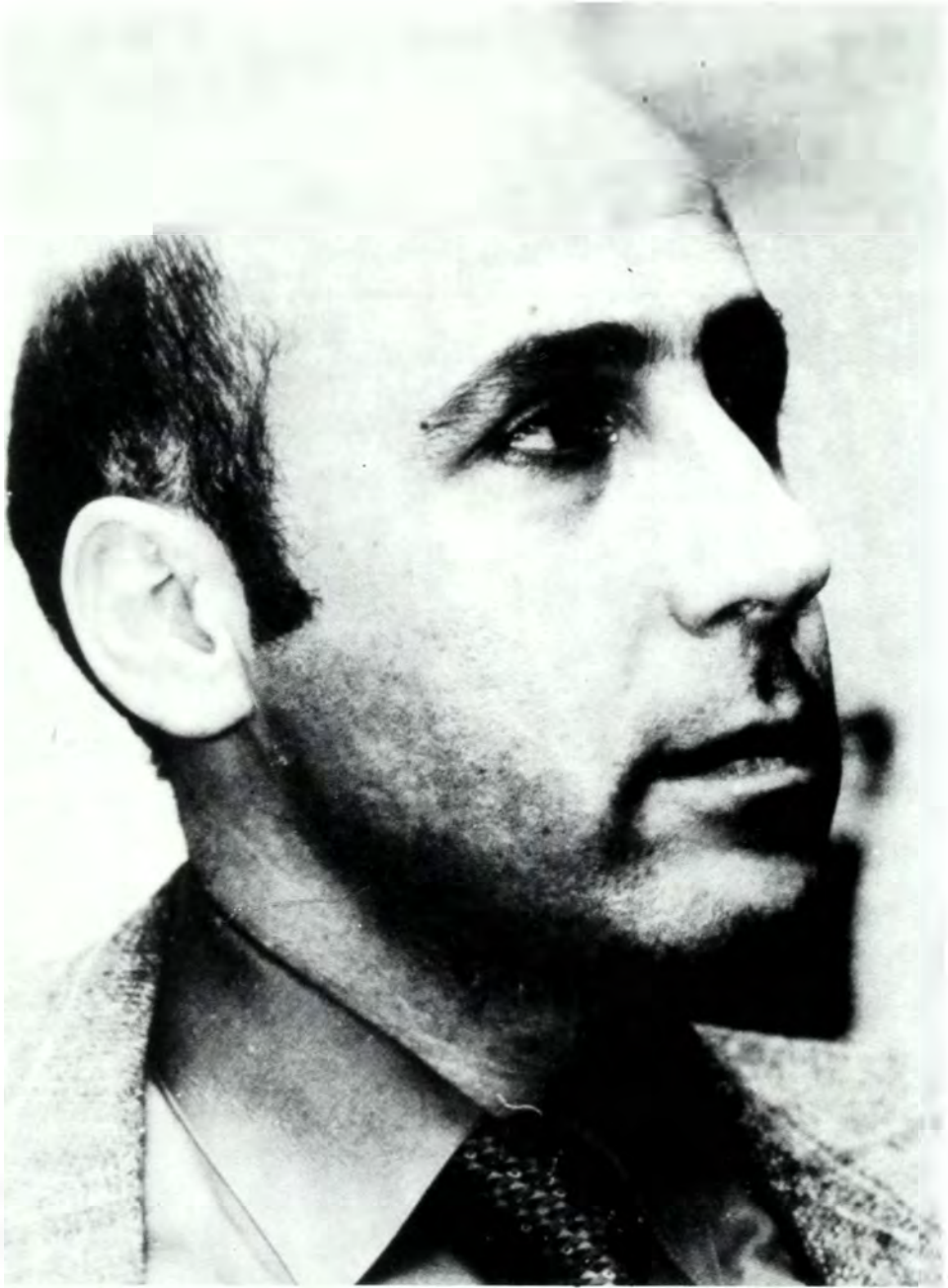
Alex Odeh, the Western regional director of the American-Arab Anti-Discrimination Committee, who was blown apart by a pipe bomb attached to his office door on October 11, 1985.