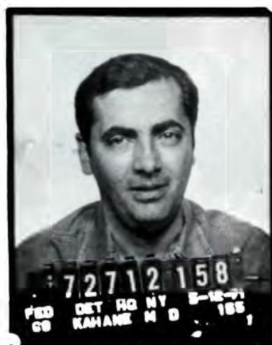
Meir Kahane, police mug shot, May 12, 1971.