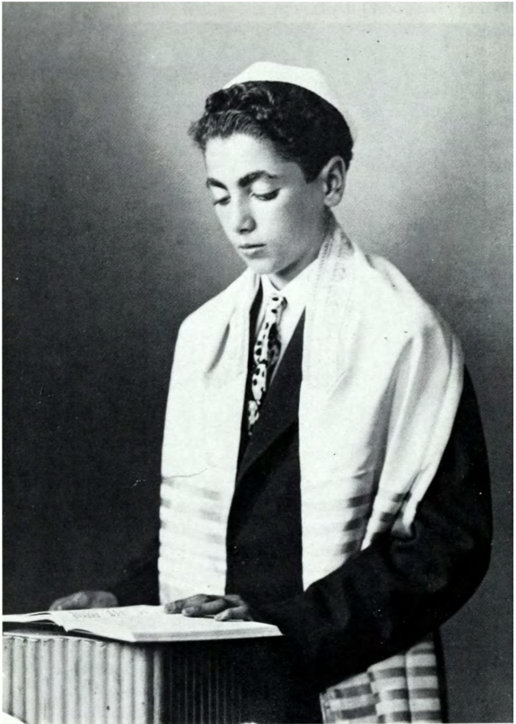
An angelic-faced Meir Kahane at his Bar Mitzvah.