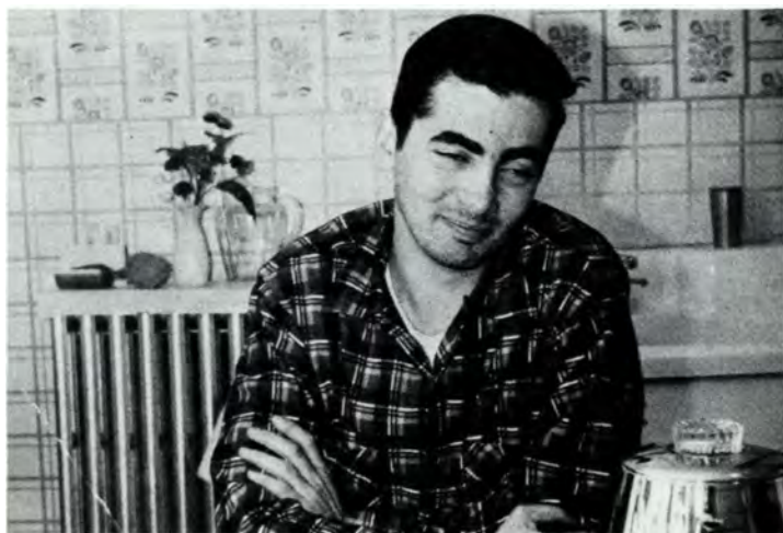
Meir Kahane, 1956.