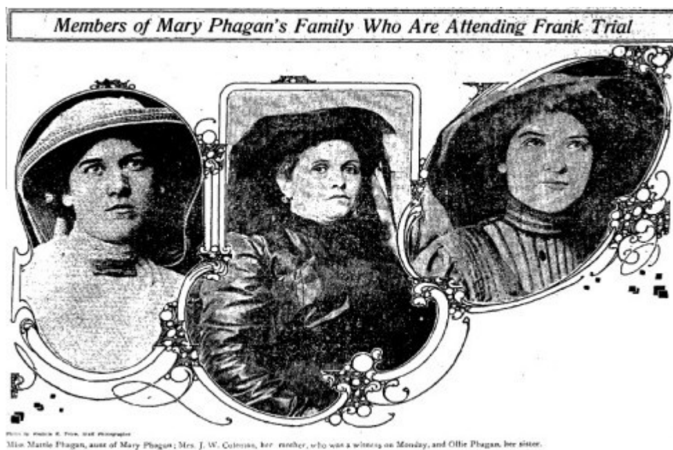
Mary Phagan's aunt, mother, and sister.