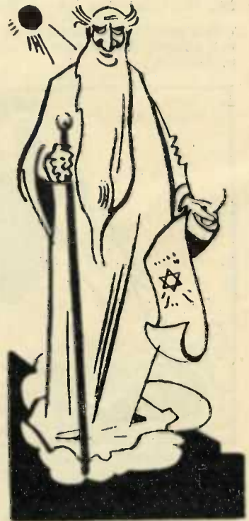
Their Heavenly Guardian Jehovah