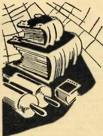
Torah and Talmud—The Webs of Obscurantism

(Caricature heading a chapter claiming that religious Jews ensnare youth into religion by offering bribes.)