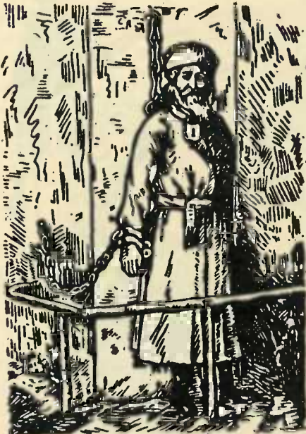
The Rabbis' Vengeance on Opponents

"Although the commandments of Judaism teach not to steal, nevertheless in many places of the Old Testament recommendations are made for the people to resort to common theft."