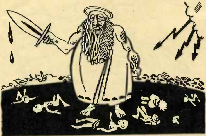
God destroyed all the first-born of Egypt

Pages 91-92—“The Jews like to talk a great deal about the Commandment which forbids them to bear false witness. However, when the