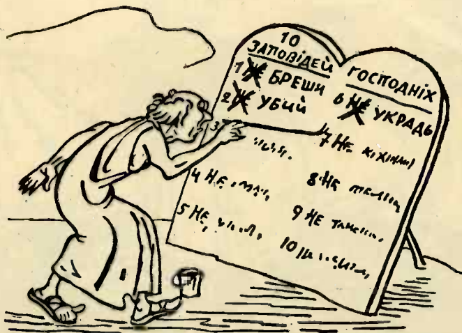
Ben Gurion At Work

"In the hands of the rabbis, these ideas are the chief spiritual weapon with whose help even today reactionary ideas are propagated, nationalistic