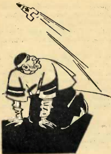
The Ensnaring Nets of Judaism Are Being Torn Up