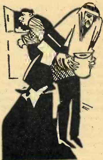
Profiteering Near the Ark of the Law

(The words "Ark of the Law" are rendered in mocking, scornful Ukrainian transliteration of the Yiddish expression, Oren Koy-desh.)