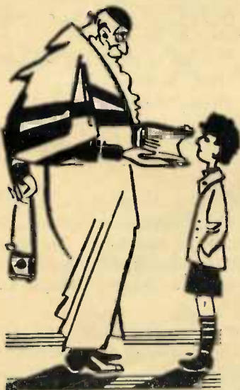
The Jewish Child-Buyers— Enemies of Youth

(The words "Ark of the Law" are rendered in mocking, scornful Ukrainian transliteration of the Yiddish expression, Oren Koy-desh.)