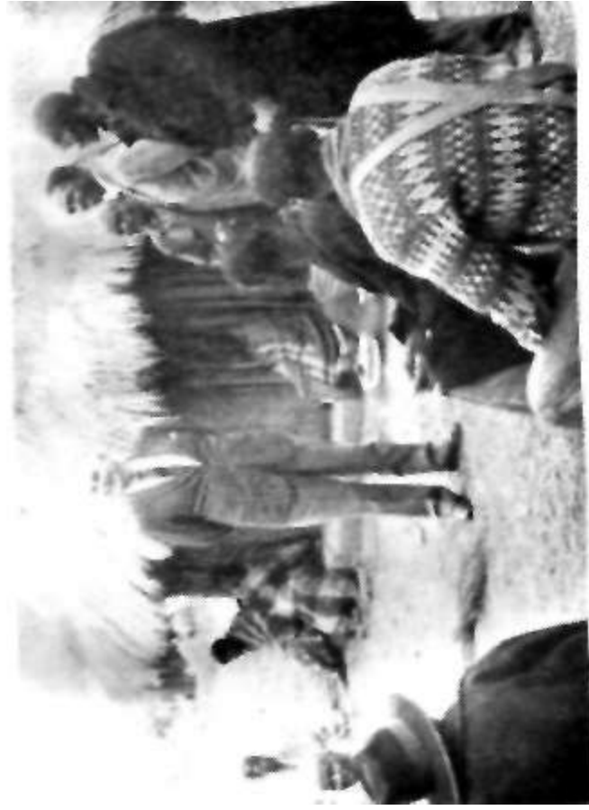
Author with some Transvaal Lemba