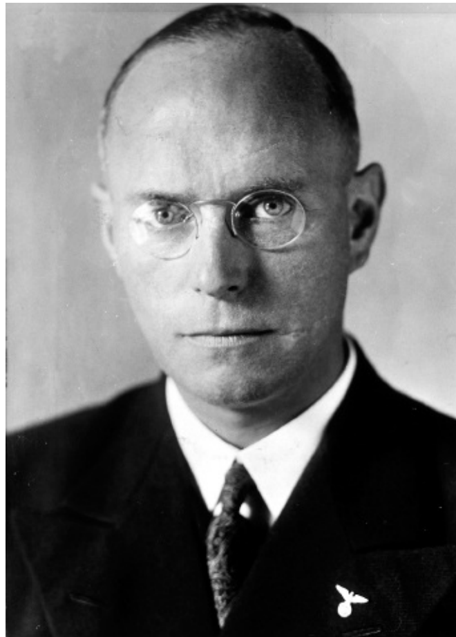
Figure 7. Bernhard Lösener.

As for Bernhard Lösener: He played his part primarily with regard to the problem of defining “Jews.” When it came to the classification of “mongrels,” party radicals inevitably favored the most expansive definition possible, and in the July 1933 Law on the Revocation of Naturalization and the Withdrawal of German Citizenship they succeeded in declaring any person with one Jewish grandparent a “Jew.” 59 This was, by the standards of Nazi policy, a far-reaching definition—though to be sure nowhere near as far-reaching as the “one-drop” rule and other racial definitions that prevailed in the American states. 60 Certainly it was too radical for moderate lawyers in the regime, who wished to take a more sparing and merciful attitude, and who pushed for less aggressive definitions over the following two years.