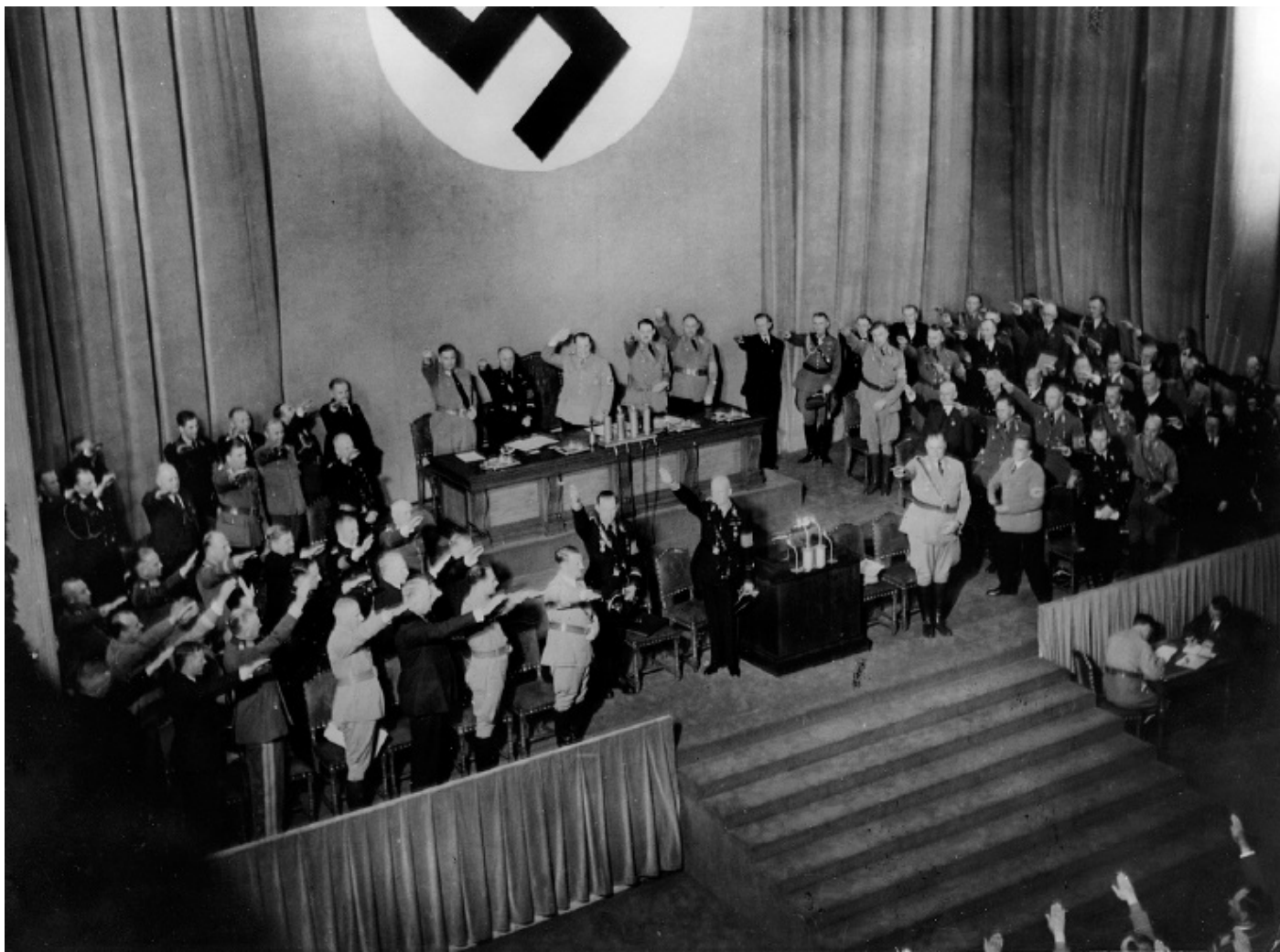
Figure 2. The gathering of the Reichstag for the promulgation of the Nuremberg Laws.

That is not to suggest that relations between the two countries were wholly harmonious in the early 1930s, or that the Nazis saw nothing to hate. It is certainly true that the American press ran many ugly stories about what was going on in Germany, and those stories certainly distressed the Nazi leadership. It is true that the Nazis abhorred the “American ideals of the God given and inalienable rights of all peoples to life, liberty and the pursuit of happiness” of which Brodsky spoke. Nevertheless, in the first years of Nazi rule there remained a widespread sense in Germany that the United States was at heart a kindred “Nordic” polity, even if it was one that remained attached to obsolete liberal and democratic forms, and one that might yet succumb to the dangers of race mixing.