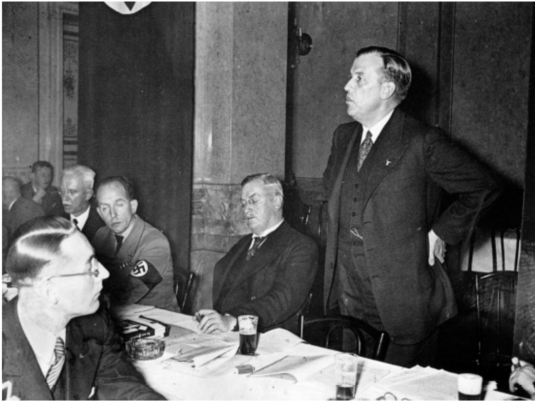
Figure 8. A meeting of the Commission on Criminal Law Reform, 1936. Center, wearing a swastika armband, is Roland Freisler. Next to him, with cigar, is Justice Minister Franz Gürtner.